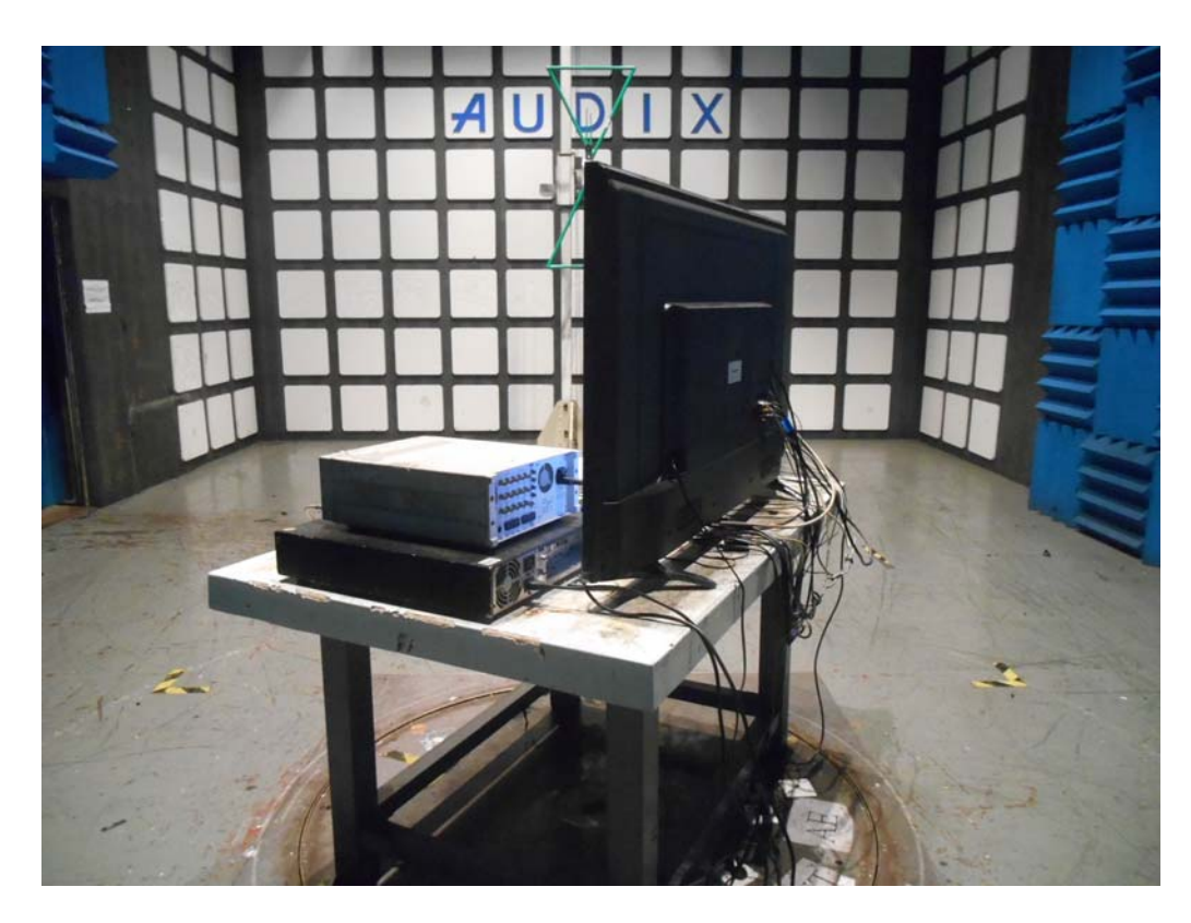
SETUP WITH MAXIMUM DETECTED EMISSION AT VERTICAL POLARIZATION (TEST MODE: HDMI 1024*768@60Hz & 1kHz playing)