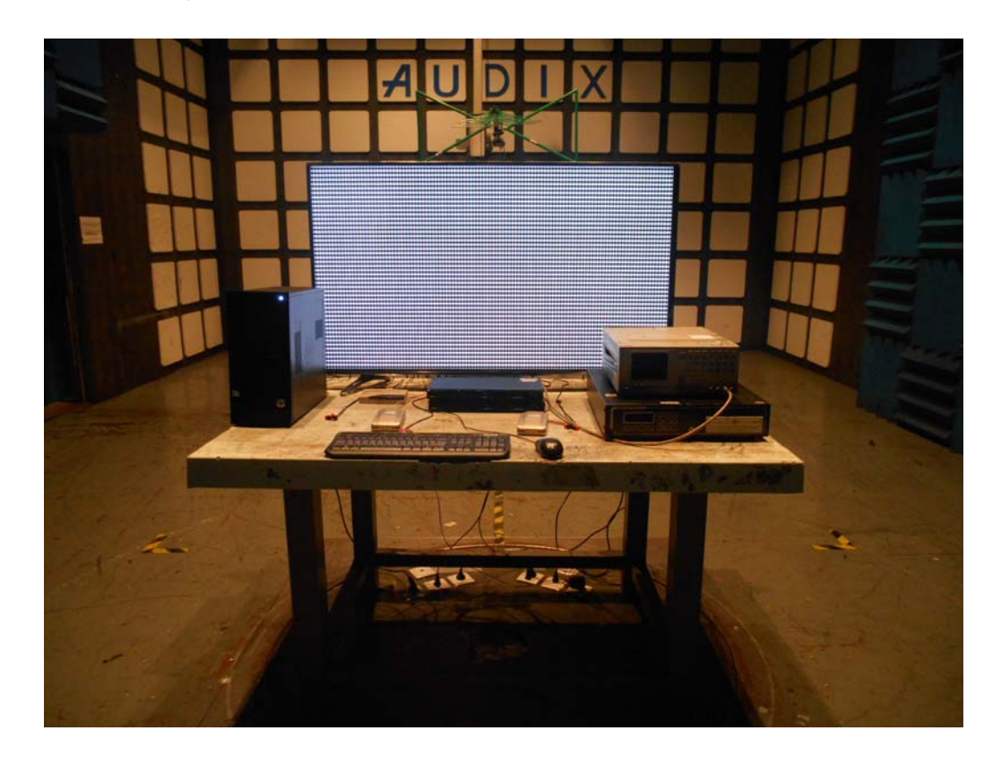
FRONT VIEW OF RADIATED EMISSION TEST