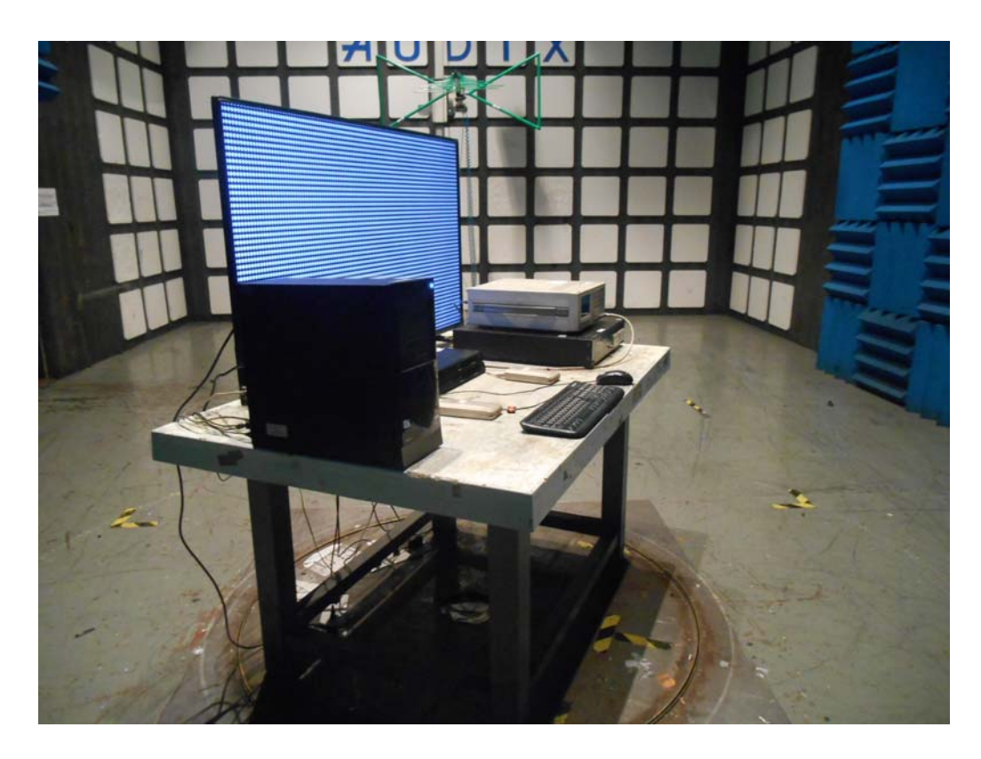
SETUP WITH MAXIMUM DETECTED EMISSION AT HORIZONTAL POLARIZATION (TEST MODE: HDMI 1024*768@60Hz & 1kHz playing)