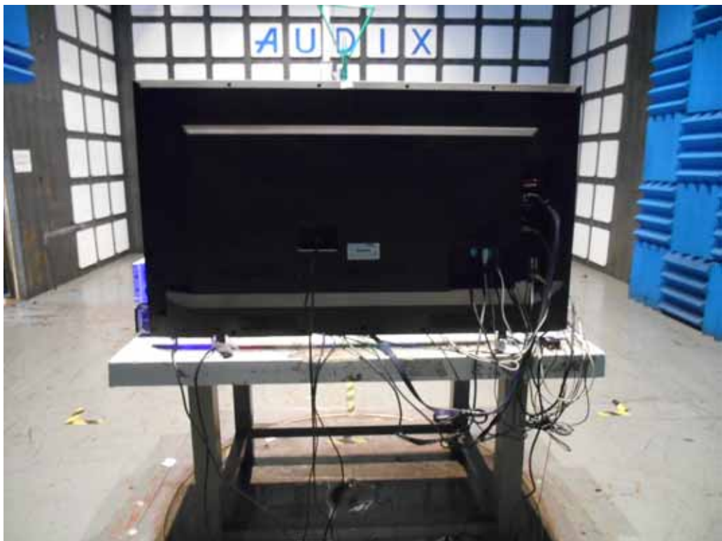
BACK VIEW OF RADIATED EMISSION TEST)