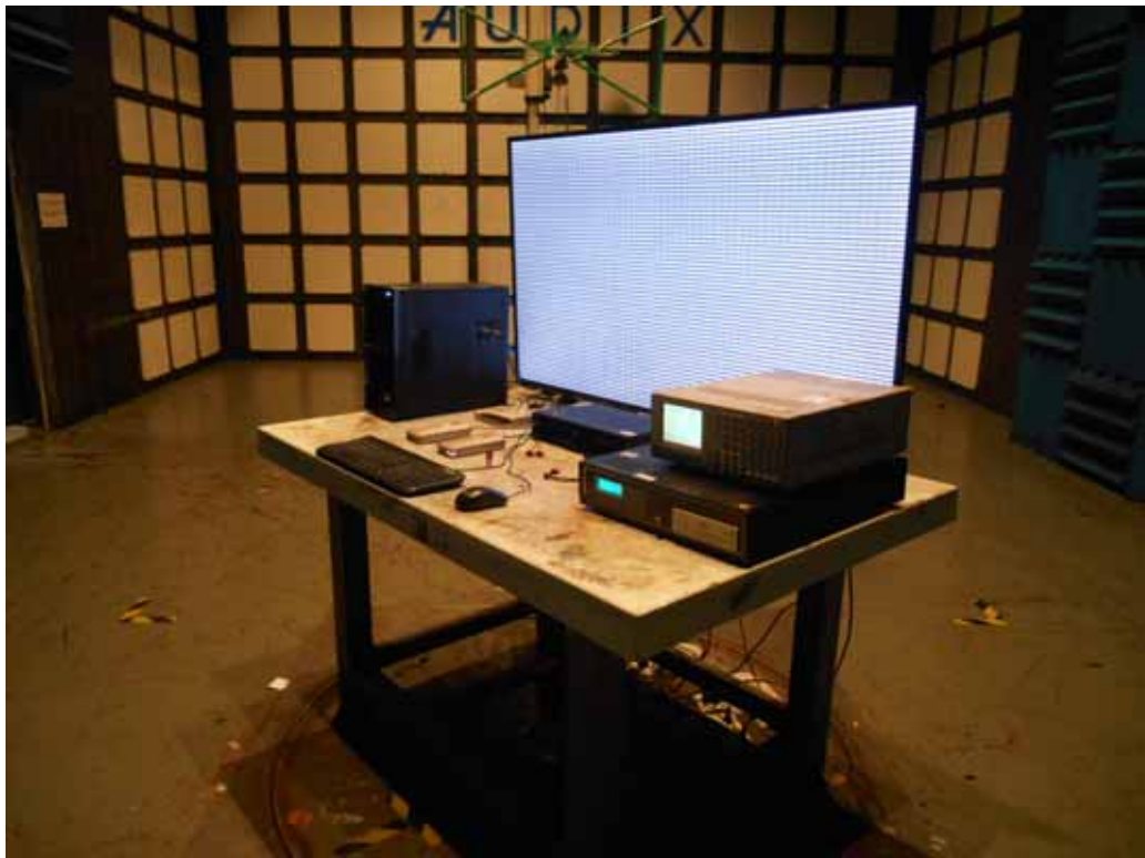
SETUP WITH MAXIMUM DETECTED EMISSION AT HORIZONTAL POLARIZATION (TEST MODE: HDMI 1024*768@60Hz & 1kHz Playing)