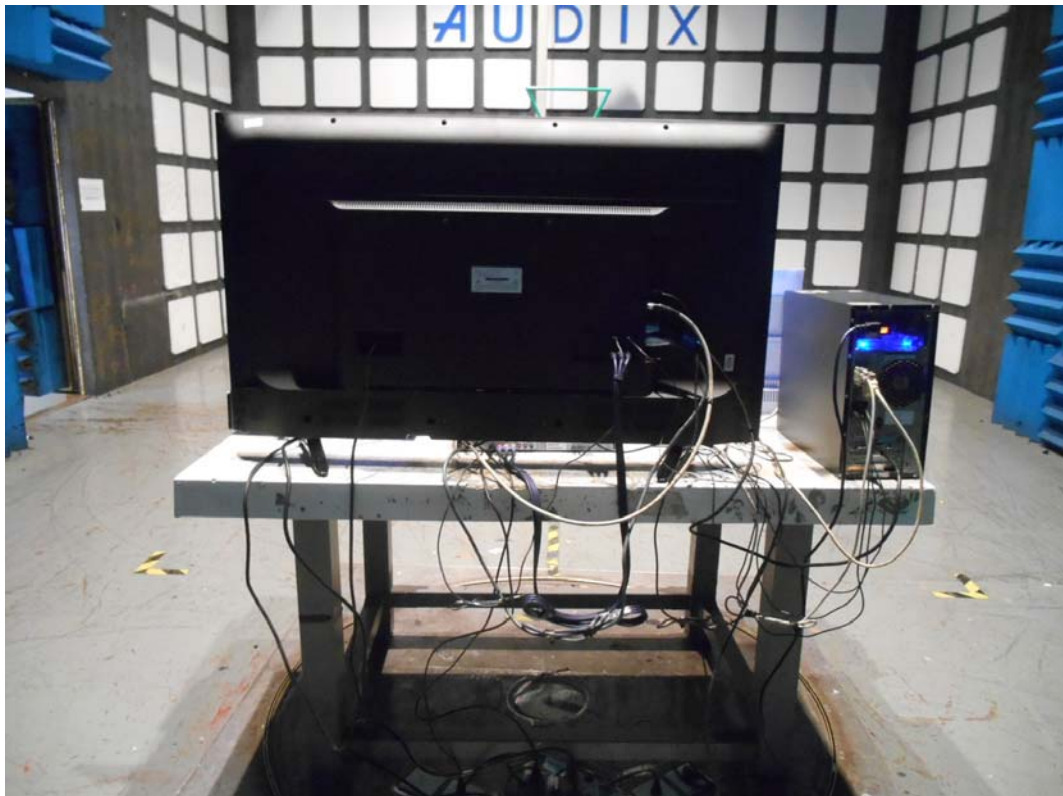
BACK VIEW OF RADIATED EMISSION TEST (BELOW 1GHZ)