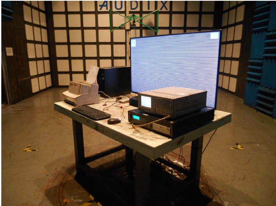
SETUP WITH MAXIMUM DETECTED EMISSION AT HORIZONTAL POLARIZATION (TEST MODE: HDMI 1920*1080@60Hz & 1KHz PLAYING)