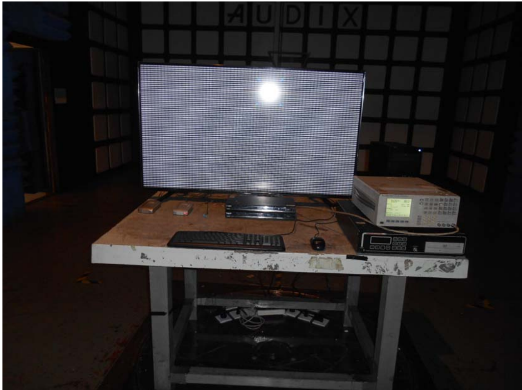
FRONT VIEW OF RADIATED EMISSION TEST (BELOW 1GHZ)