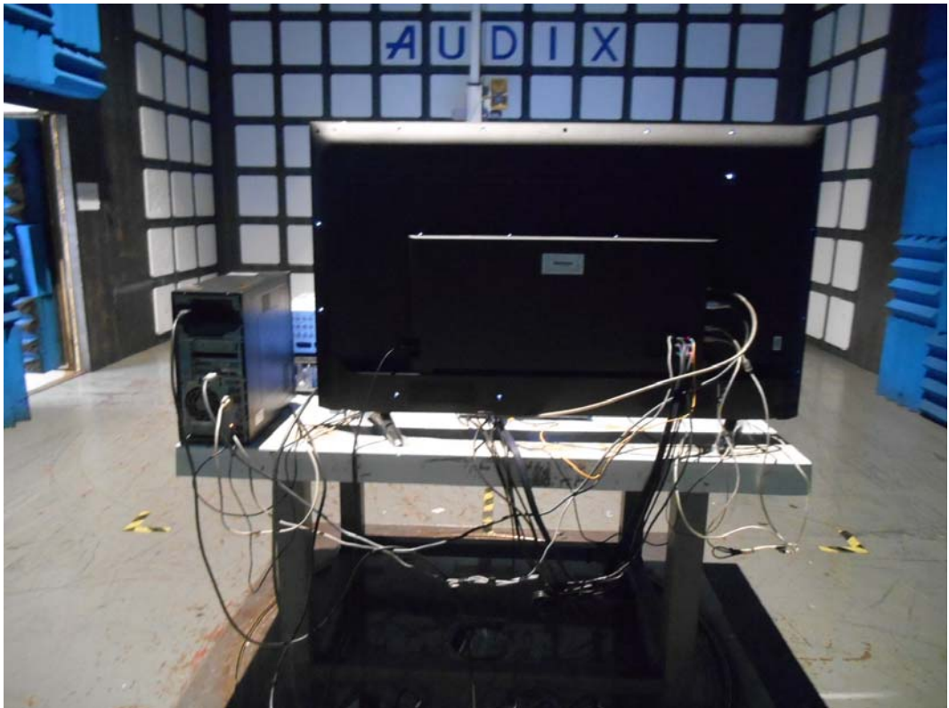
BACK VIEW OF RADIATED EMISSION TEST (ABOVE 1GHZ)