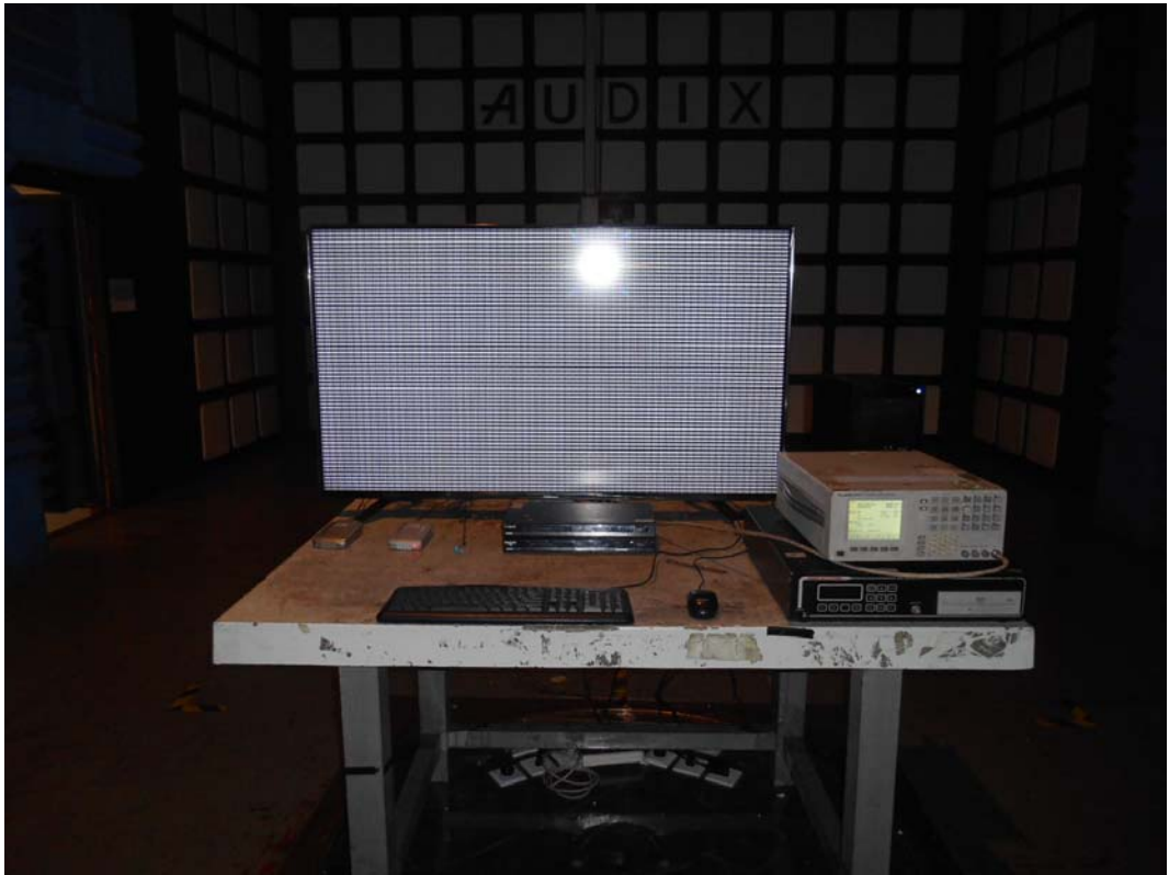
FRONT VIEW OF RADIATED EMISSION TEST (ABOVE 1GHZ)