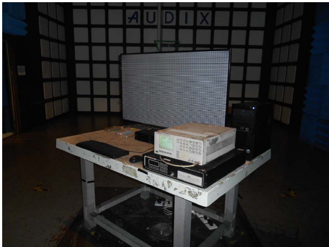
SETUP WITH MAXIMUM DETECTED EMISSION AT VERTICAL POLARIZATION (TEST MODE: HDMI 1920*1080@60Hz & 1kHz PLAYING)