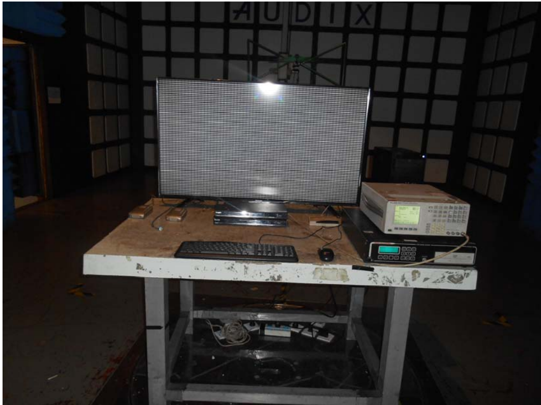
FRONT VIEW OF RADIATED EMISSION TEST (BELOW 1GHZ)