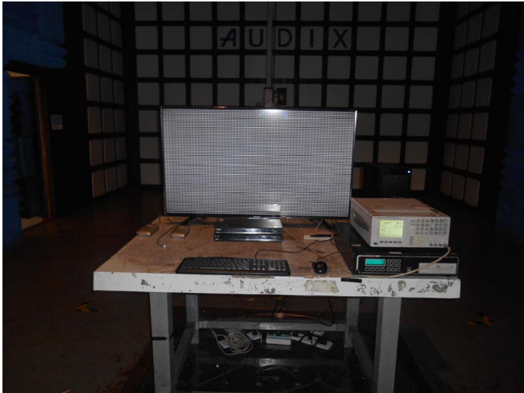
FRONT VIEW OF RADIATED EMISSION TEST (ABOVE 1GHZ)