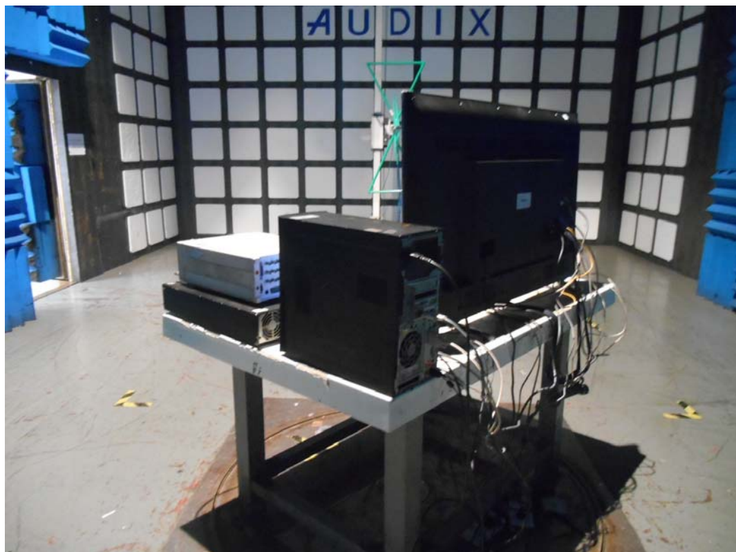
SETUP WITH MAXIMUM DETECTED EMISSION AT VERTICAL POLARIZATION (TEST MODE: HDMI 1920*1080@60Hz & 1KHz PLAYING)