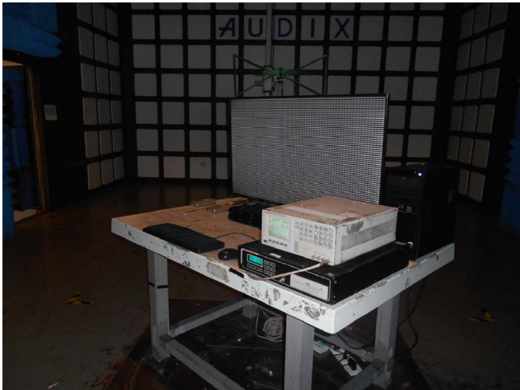
SETUP WITH MAXIMUM DETECTED EMISSION AT HORIZONTAL POLARIZATION (TEST MODE: HDMI 1920*1080@60Hz & 1KHz PLAYING)