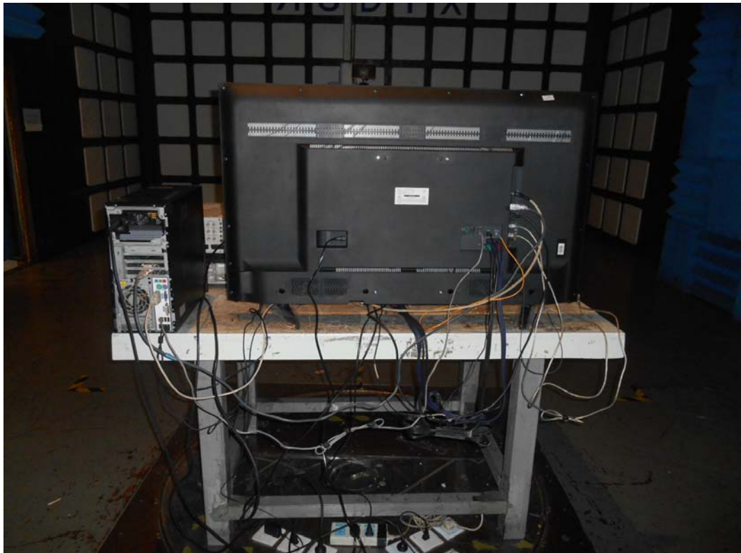
BACK VIEW OF RADIATED EMISSION TEST (ABOVE 1GHZ)