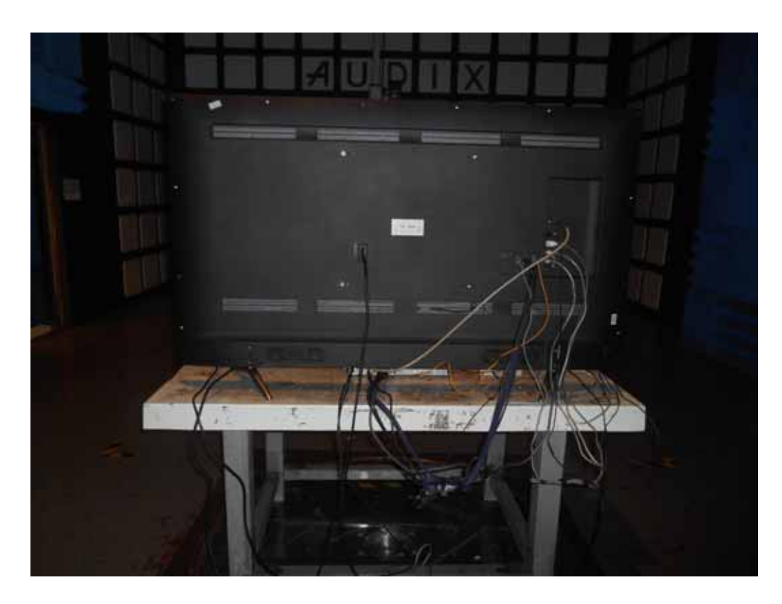
BACK VIEW OF RADIATED EMISSION TEST (ABOVE 1GHZ)