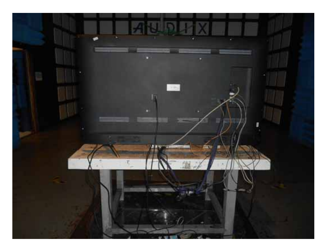
BACK VIEW OF RADIATED EMISSION TEST (BELOW 1GHZ)