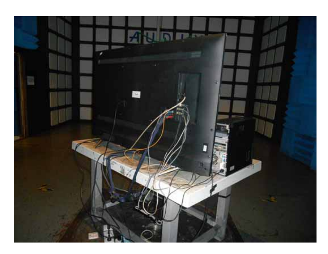
SETUP WITH MAXIMUM DETECTED EMISSION AT HORIZONTAL POLARIZATION (TEST MODE: HDMI 1920*1080@60Hz & 1kHz Playing)