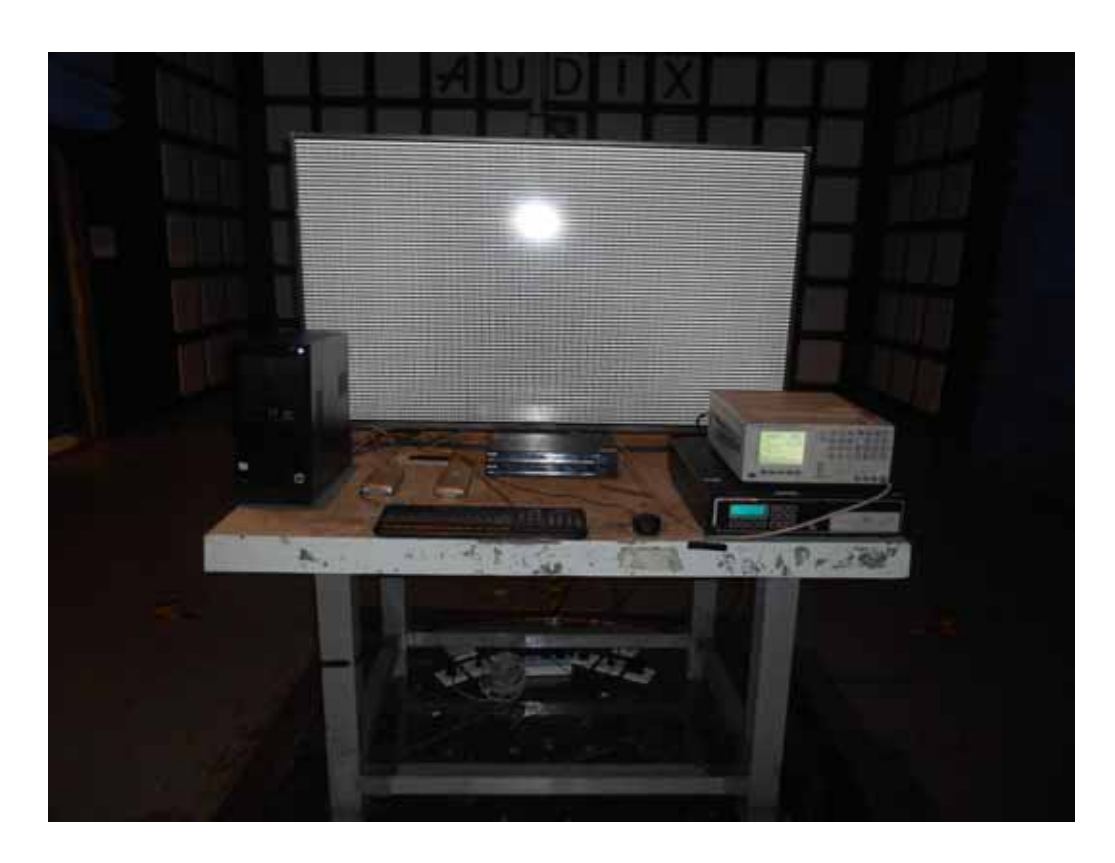
FRONT VIEW OF RADIATED EMISSION TEST (ABOVE 1GHZ)