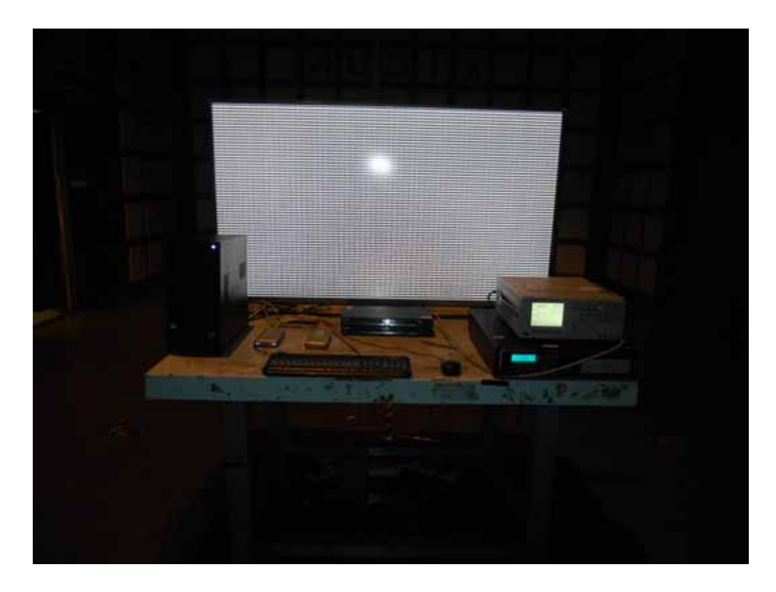
FRONT VIEW OF RADIATED EMISSION TEST (BELOW 1GHZ)