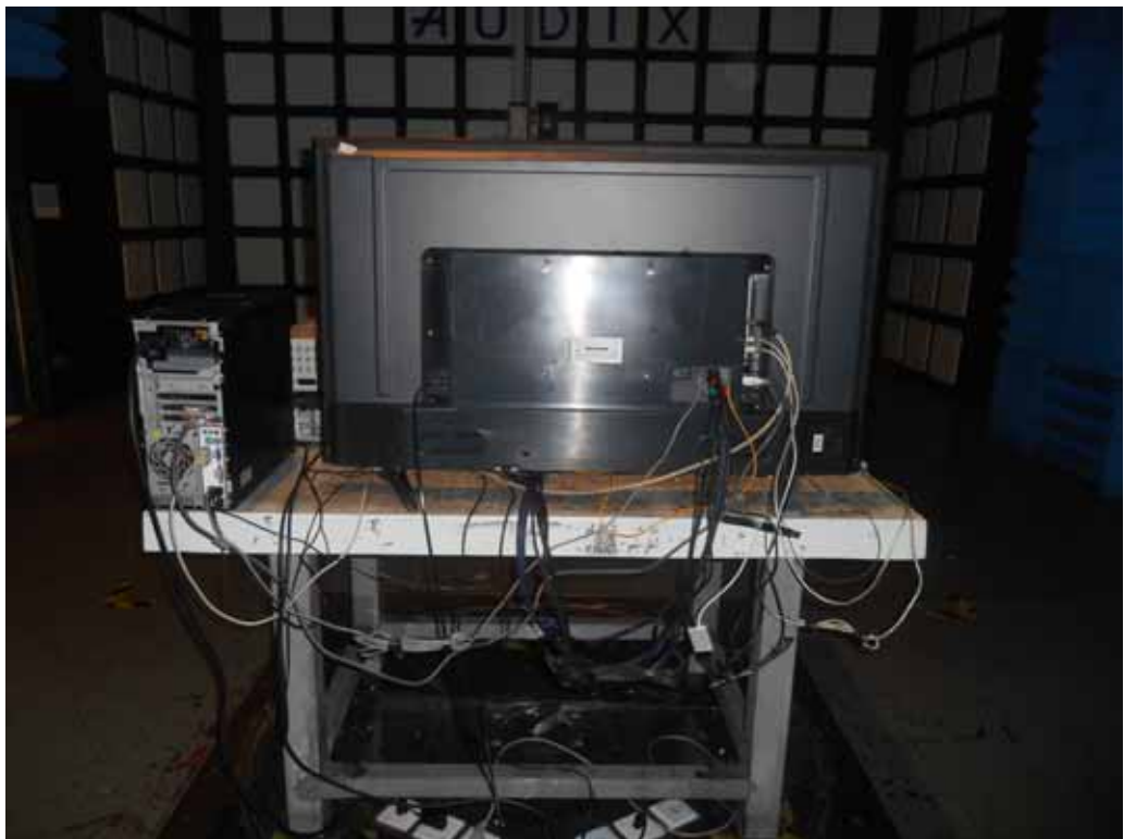
BACK VIEW OF RADIATED EMISSION TEST (ABOVE 1GHZ)