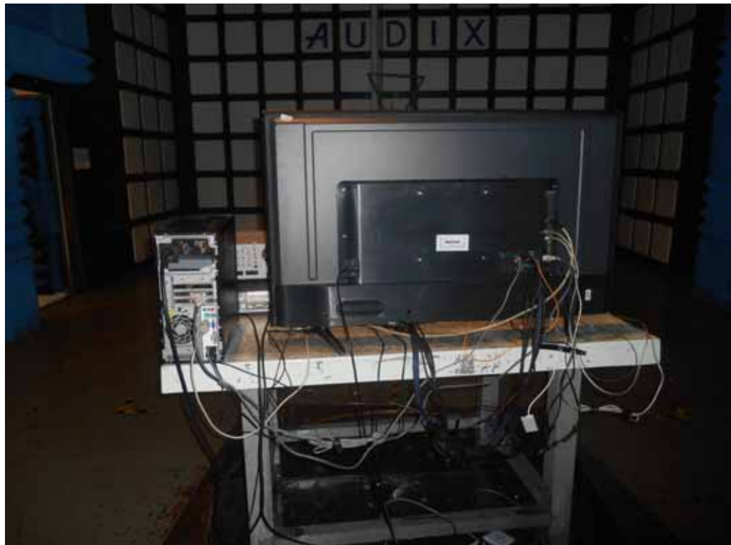
SETUP WITH MAXIMUM DETECTED EMISSION AT VERTICAL POLARIZATION (TEST MODE: HDMI 3840*2160@60Hz & 1kHz PLAYING)