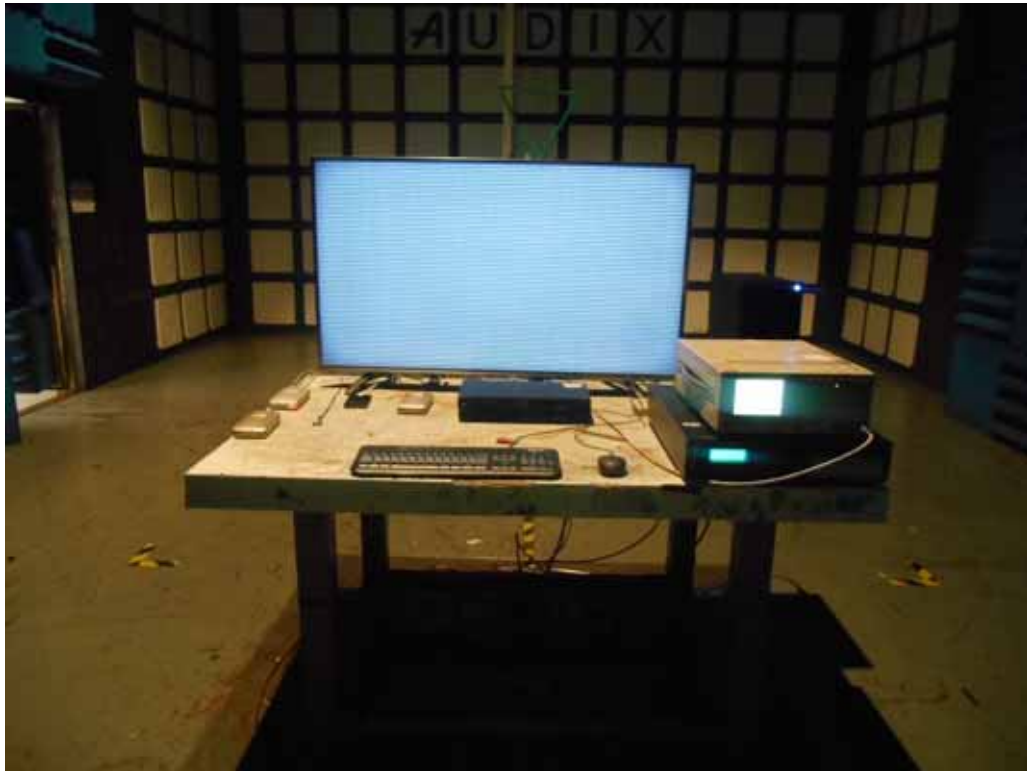
FRONT VIEW OF RADIATED EMISSION TEST (BELOW 1GHZ)