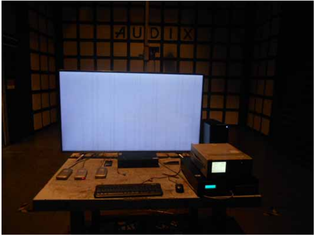
FRONT VIEW OF RADIATED EMISSION TEST (ABOVE 1GHZ)