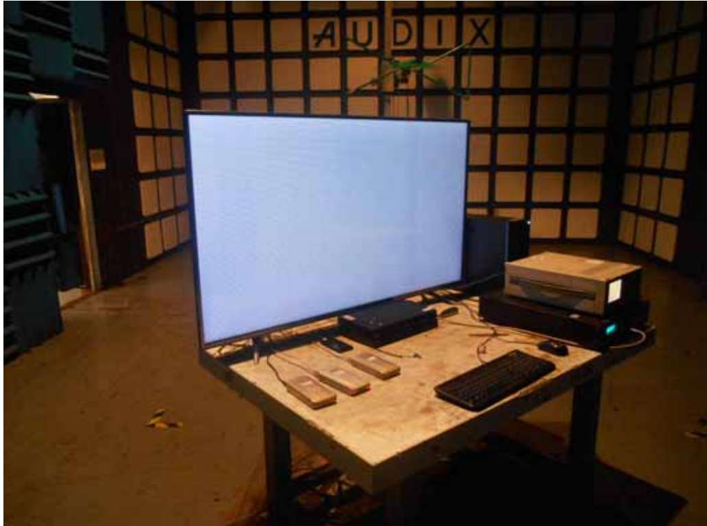
SETUP WITH MAXIMUM DETECTED EMISSION AT HORIZONTAL POLARIZATION (TEST MODE: HDMI 3840*2160@60HZ & 1KHZ PLAYING)