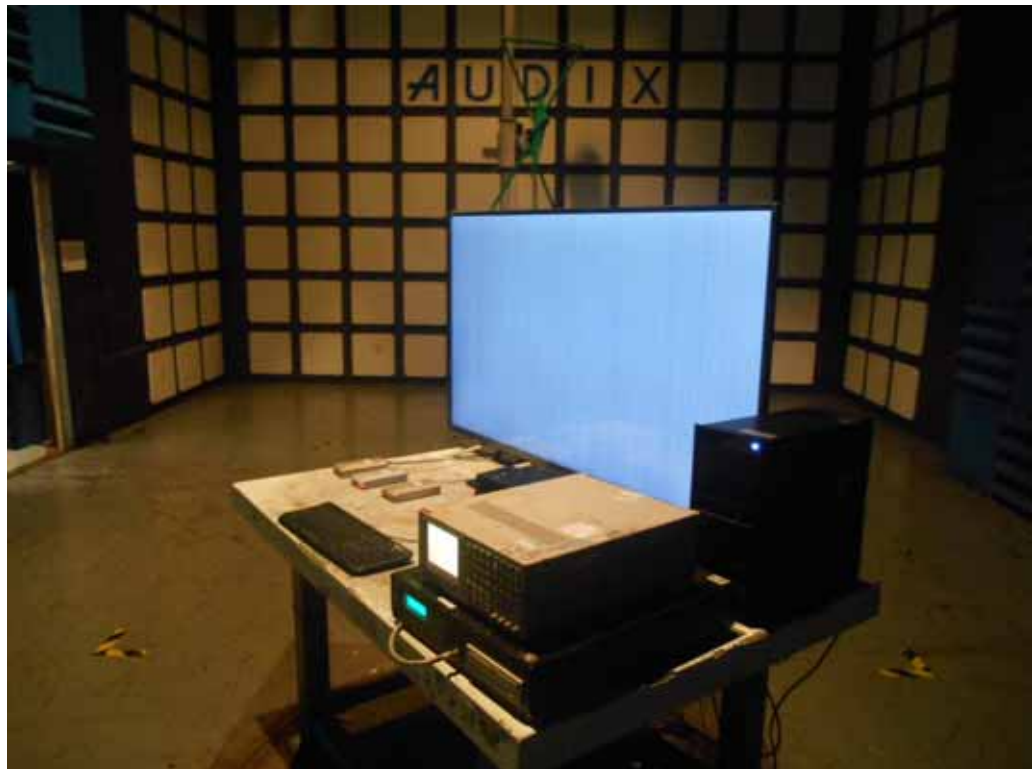
SETUP WITH MAXIMUM DETECTED EMISSION AT VERTICAL POLARIZATION (TEST MODE: HDMI 3840*2160@60HZ & 1KHZ PLAYING)