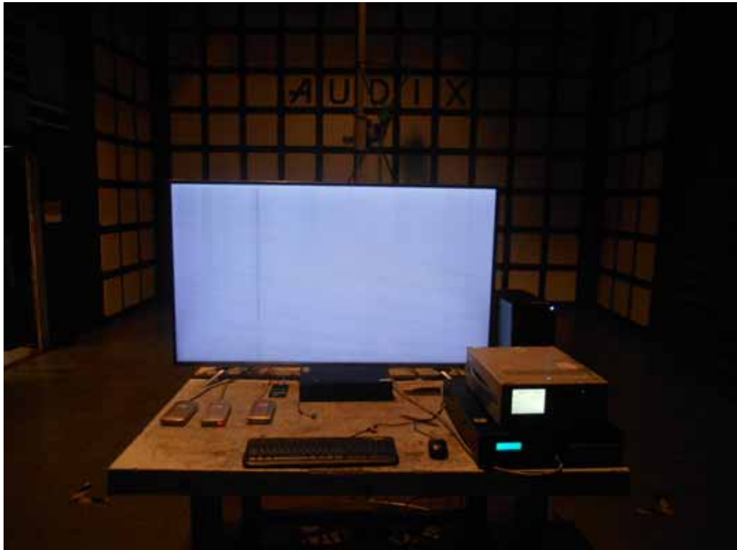
FRONT VIEW OF RADIATED EMISSION TEST (BELOW 1GHZ)