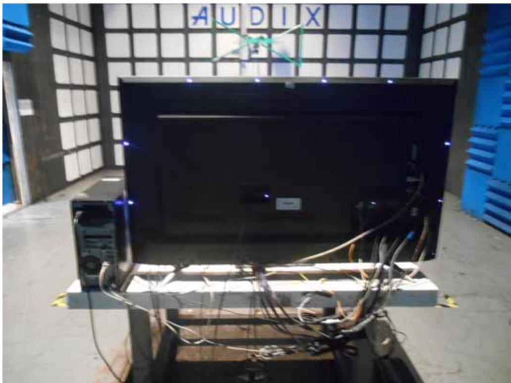
BACK VIEW OF RADIATED EMISSION TEST (BELOW 1GHZ)