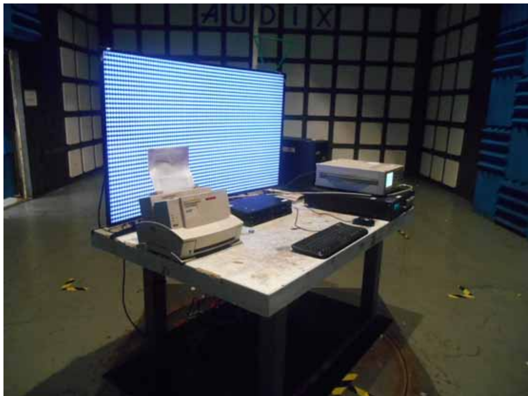
SETUP WITH MAXIMUM DETECTED EMISSION AT VERTICAL POLARIZATION (TEST MODE: HDMI 3840*2160@60HZ & 1KHZ PLAYING)