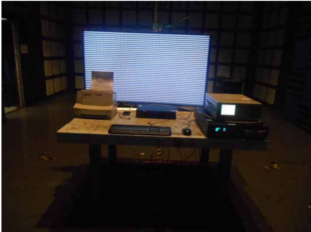
FRONT VIEW OF RADIATED EMISSION TEST