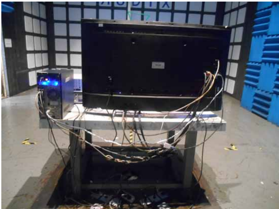
BACK VIEW OF RADIATED EMISSION TEST