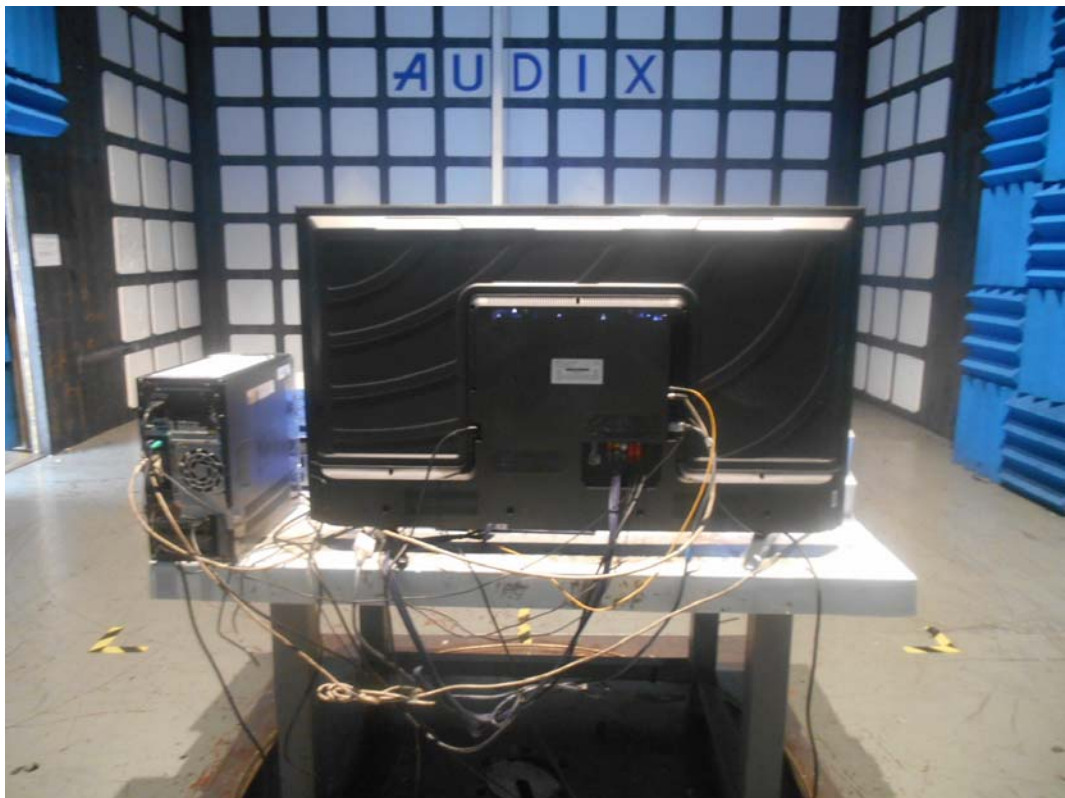
BACK VIEW OF RADIATED EMISSION TEST