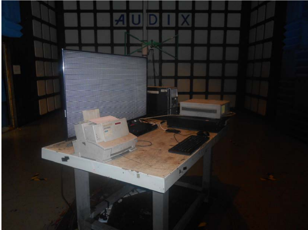
SETUP WITH MAXIMUM DETECTED EMISSION AT HORIZONTAL POLARIZATION (TEST MODE: HDMI 1280*1024@60Hz & 1kHz PLAYING)