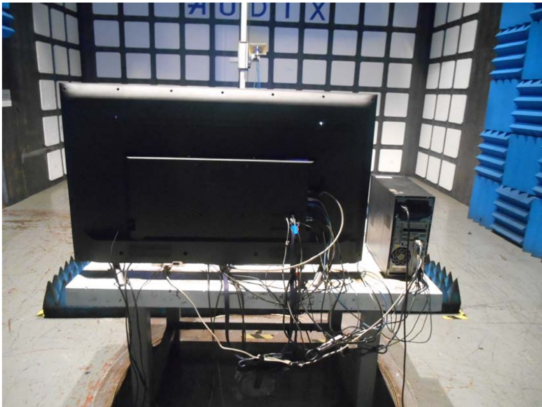
BACK VIEW OF RADIATED EMISSION TEST (ABOVE 1GHZ)