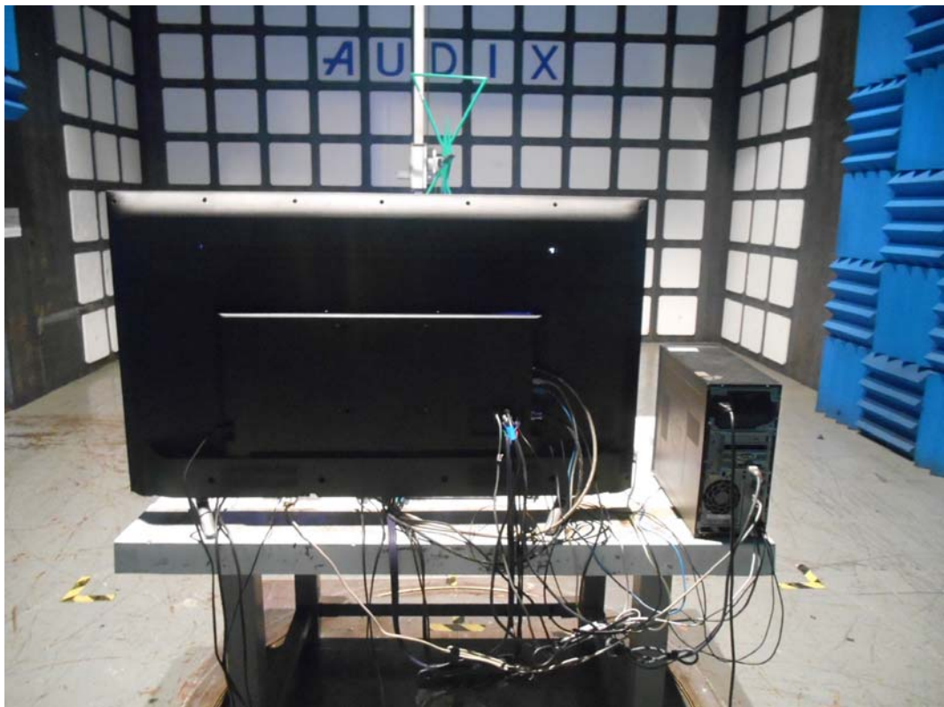
BACK VIEW OF RADIATED EMISSION TEST