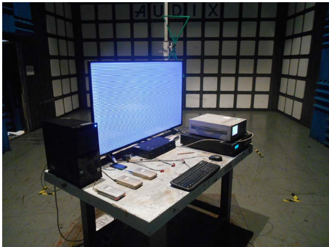
SETUP WITH MAXIMUM DETECTED EMISSION AT VERTICAL POLARIZATION (TEST MODE: HDMI 1920*1080@60HZ & 1KHZ PLAYING)