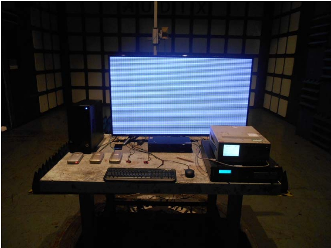
FRONT VIEW OF RADIATED EMISSION TEST (ABOVE 1GHZ)