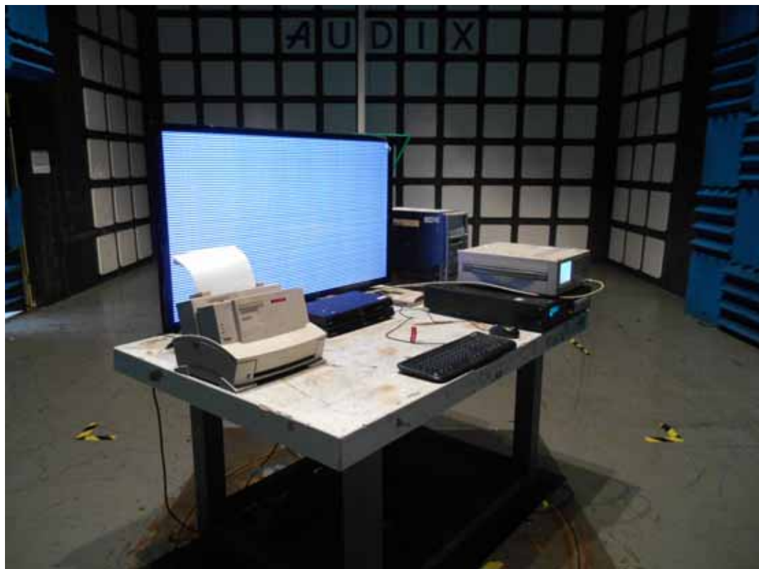
SETUP WITH MAXIMUM DETECTED EMISSION AT VERTICAL POLARIZATION (TEST MODE: HDMI 1920*1080@60HZ & 1KHZ PLAYING)