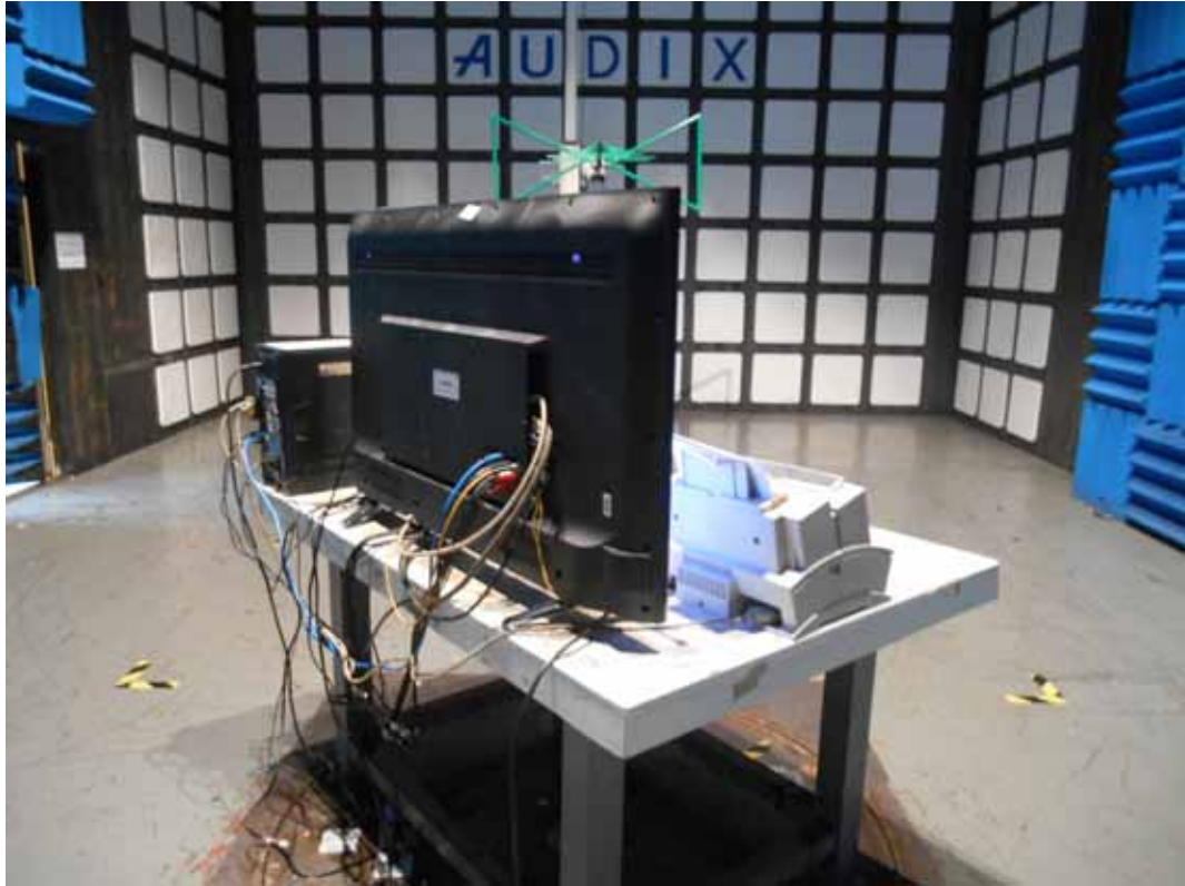
SETUP WITH MAXIMUM DETECTED EMISSION AT HORIZONTAL POLARIZATION (TEST MODE: HDMI 1920*1080@60HZ & 1KHZ PLAYING)