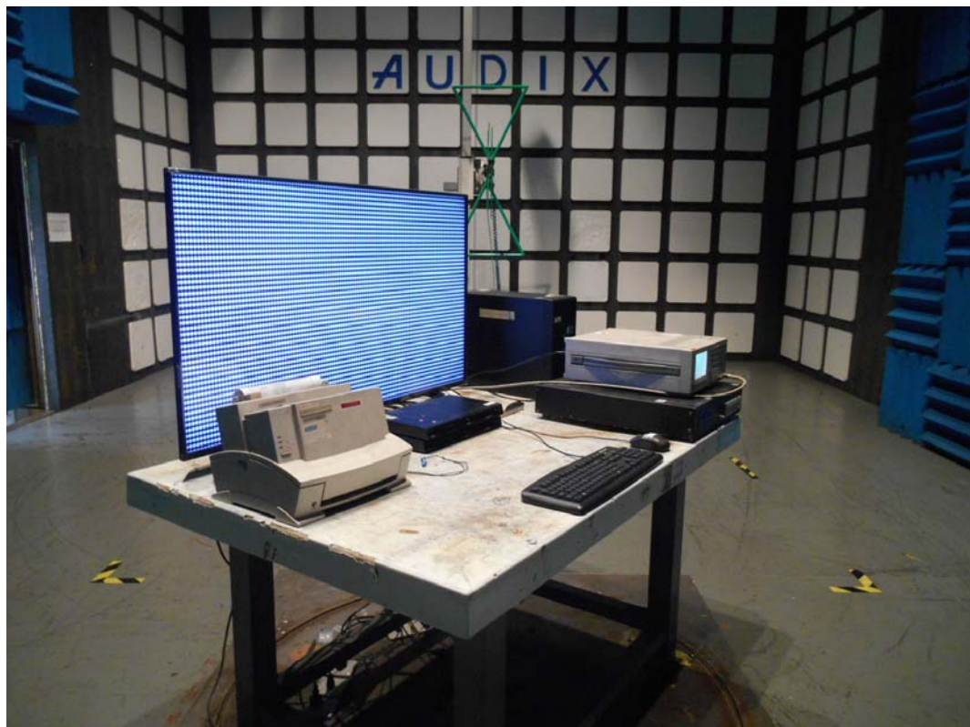
SETUP WITH MAXIMUM DETECTED EMISSION AT VERTICAL POLARIZATION (TEST MODE: HDMI 1920*1080@60HZ & 1KHZ PLAYING)