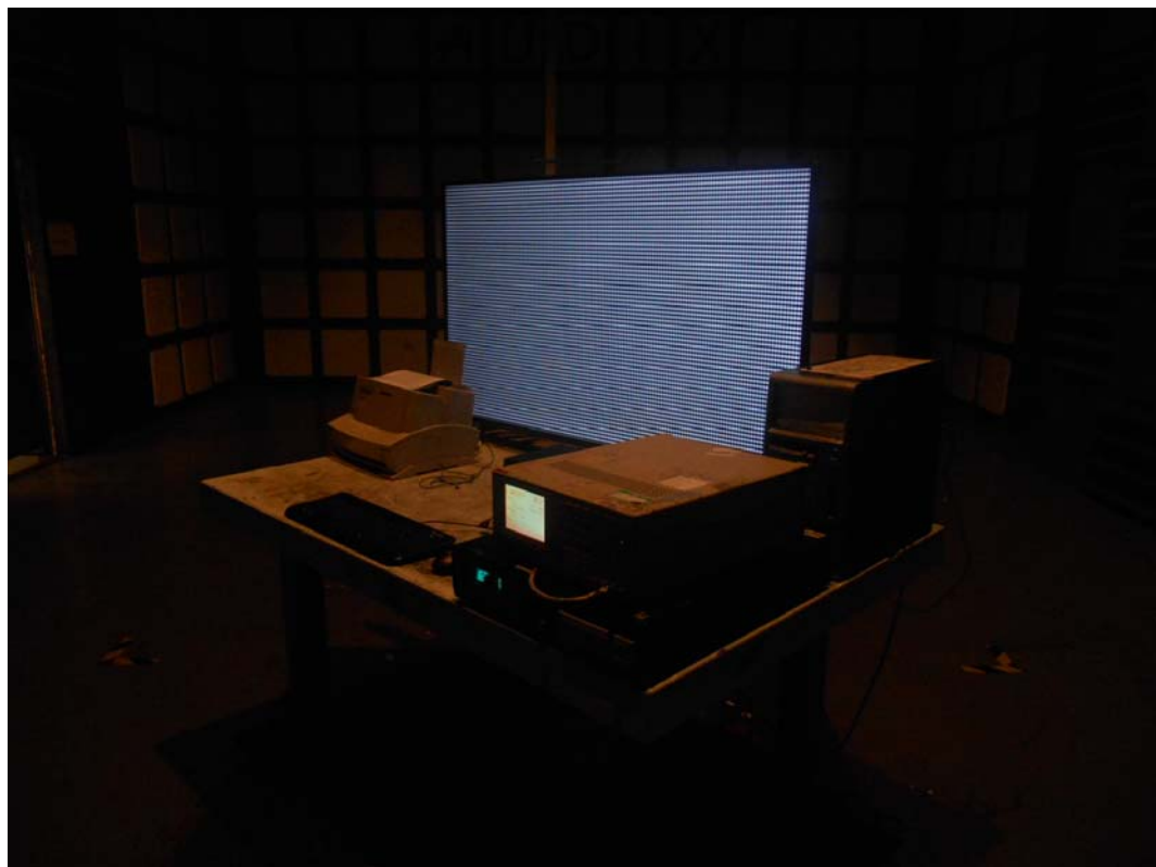
SETUP WITH MAXIMUM DETECTED EMISSION AT VERTICAL POLARIZATION (TEST MODE: HDMI 640*480@60Hz & 1KHz PLAYING)