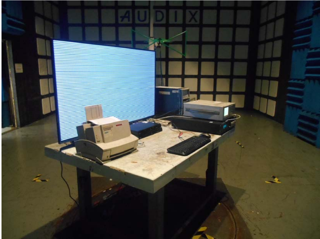
SETUP WITH MAXIMUM DETECTED EMISSION AT HORIZONTAL POLARIZATION (TEST MODE: HDMI 640*480@60Hz & 1KHz PLAYING)