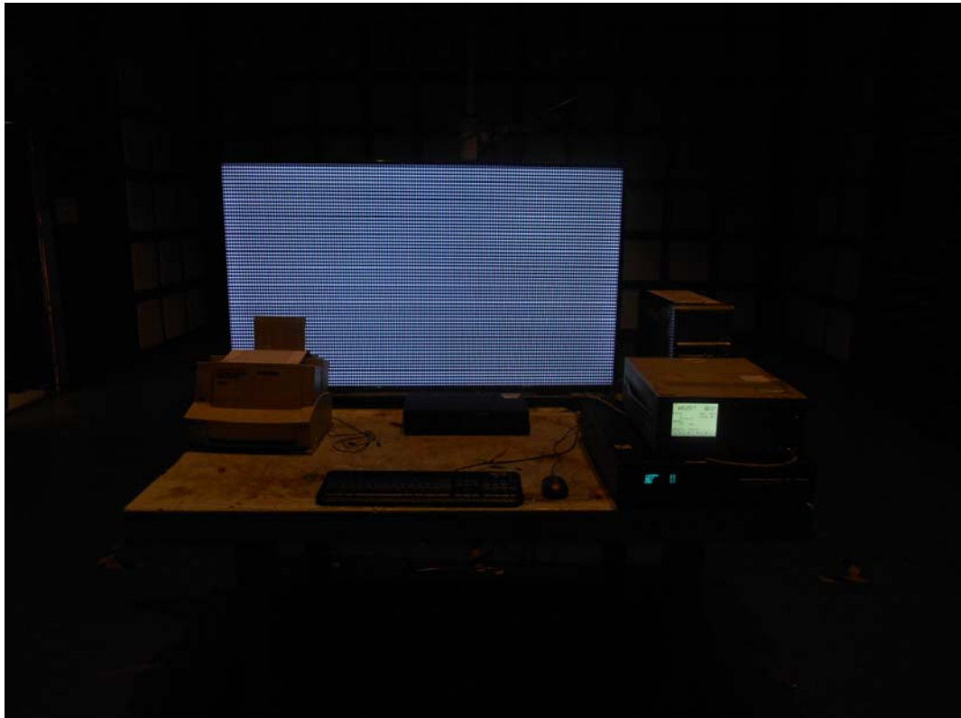
FRONT VIEW OF RADIATED EMISSION TEST