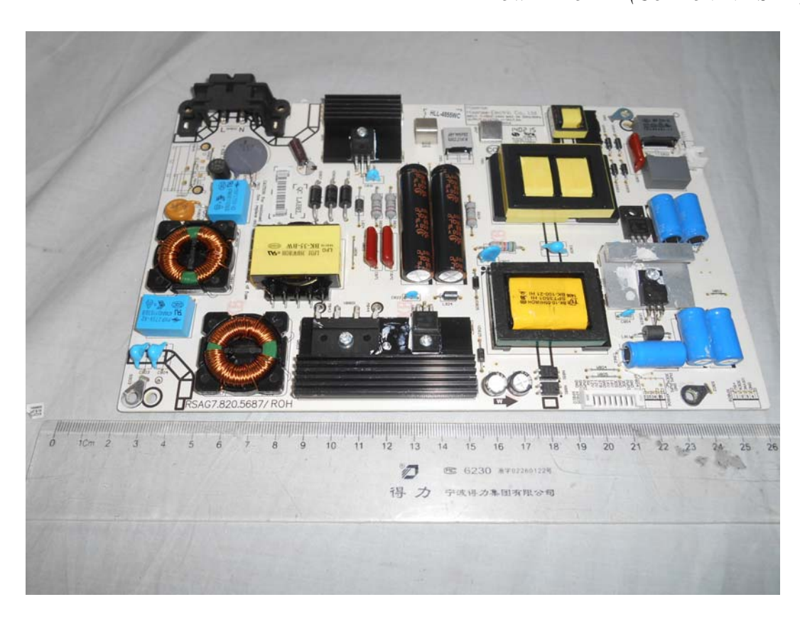
FIGURE 4 LED LCD TV (M/N: 55H4G) POWER BOARD (SOLDERED SIDE)