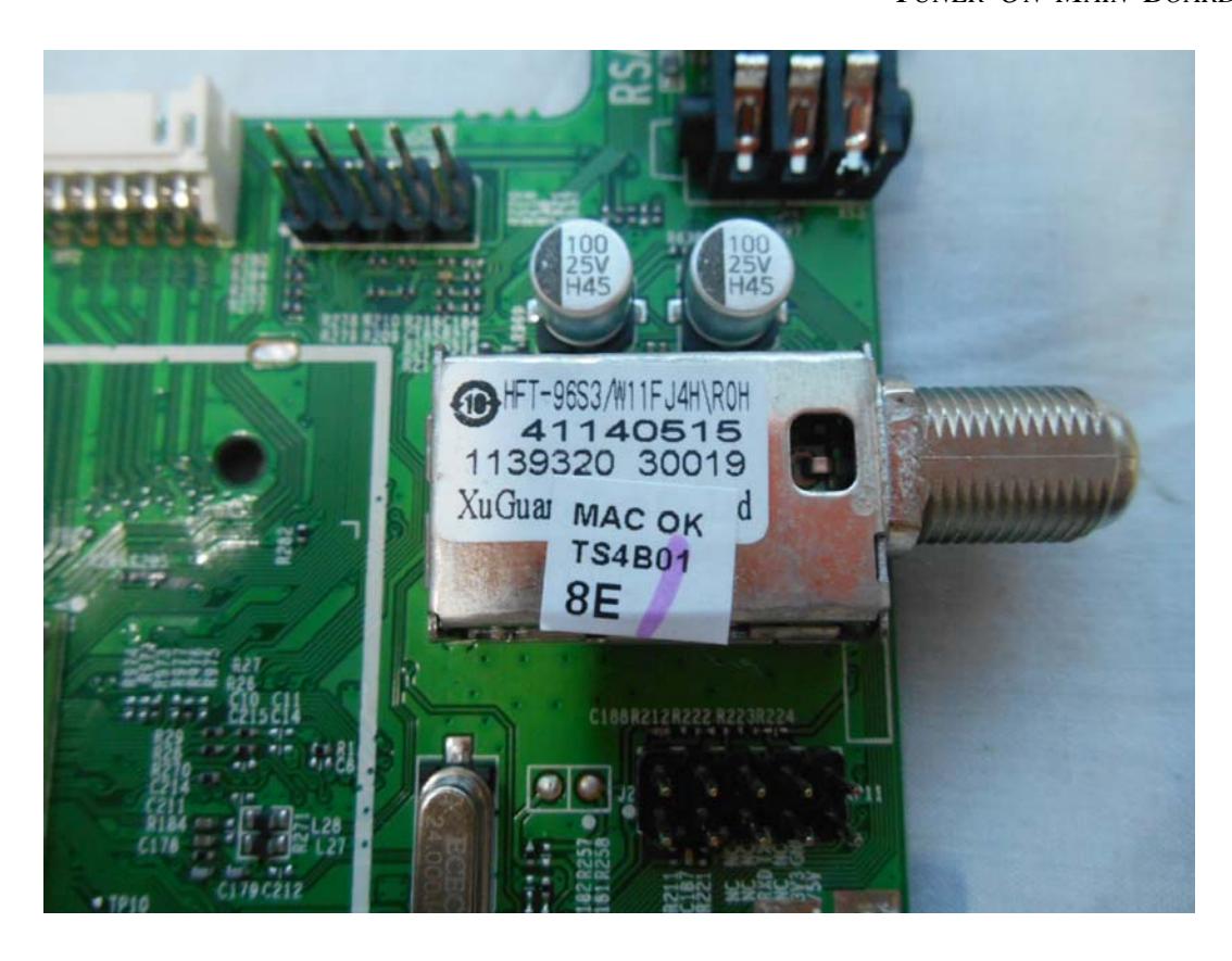
FIGURE 10 LED LCD TV (M/N: 55H4G) TUNER BOARD