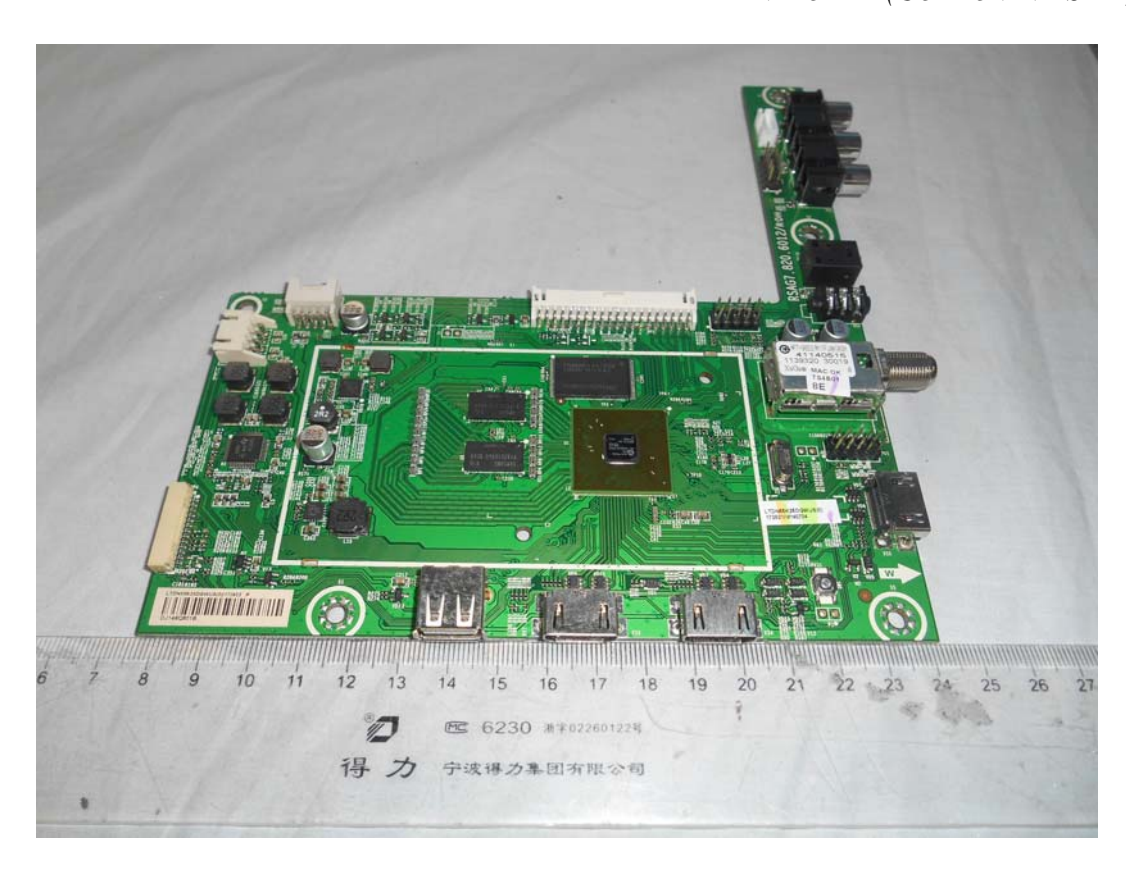
FIGURE 6 LED LCD TV (M/N: 55H4G) MAIN BOARD (SOLDERED SIDE)