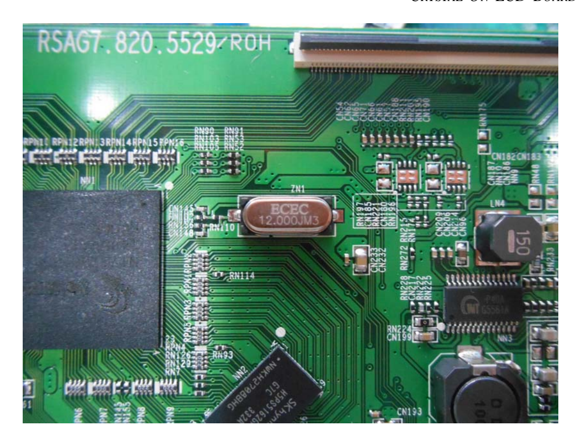
FIGURE 16 LED LCD TV (M/N: 55H4G) RF BOARD (COMPONENT SIDE)