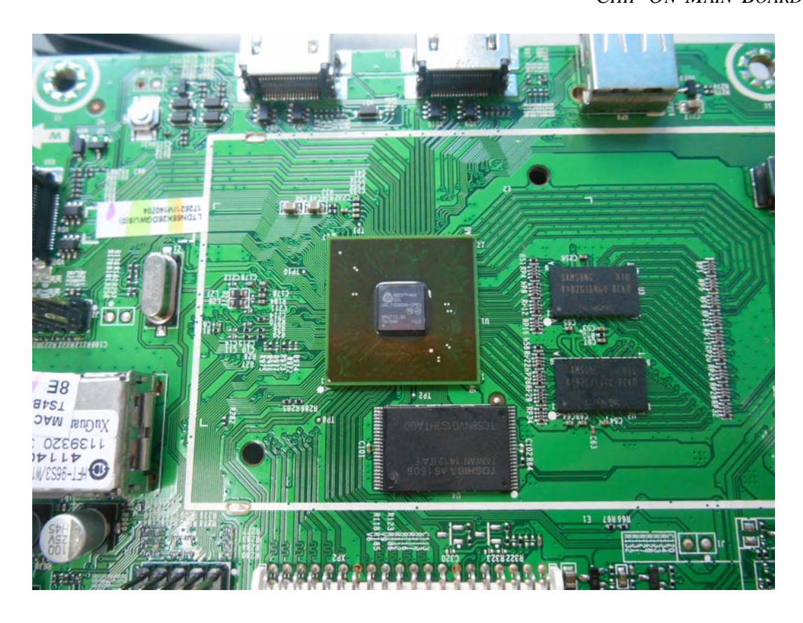
FIGURE 8 LED LCD TV (M/N: 55H4G) CRYSTAL ON MAIN BOARD