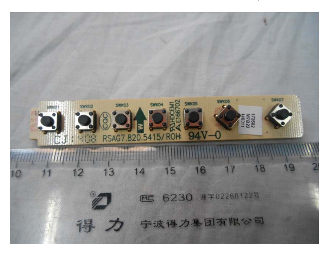
FIGURE 12 LED LCD TV (M/N: 55H4G) KEY BOARD (SOLDERED SIDE)