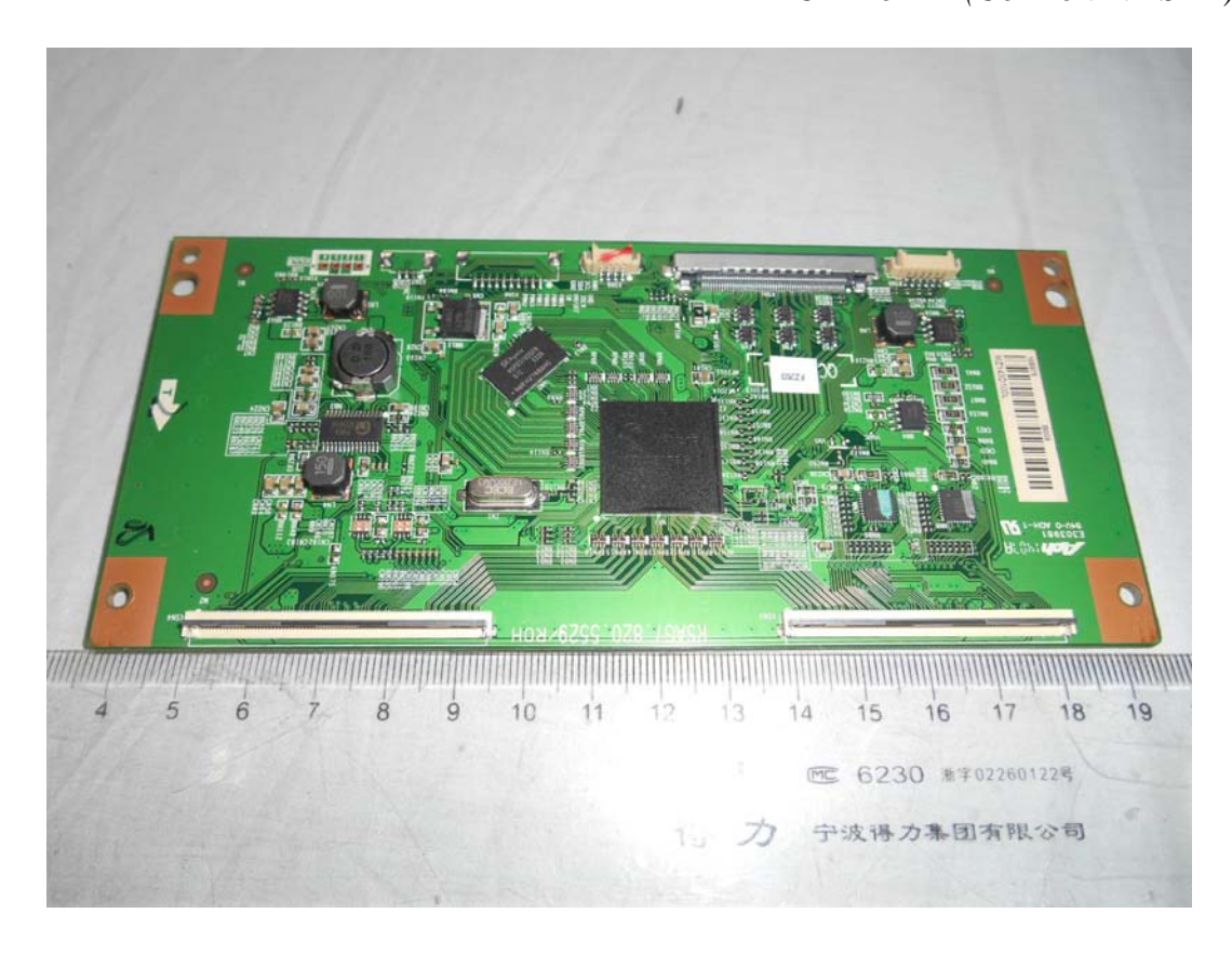
FIGURE 14 LED LCD TV (M/N: 55H4G) LCD BOARD (SOLDERED SIDE)