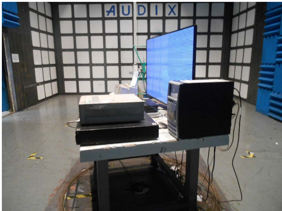
SETUP WITH MAXIMUM DETECTED EMISSION AT VERTICAL POLARIZATION (TEST MODE: USB PLAY)