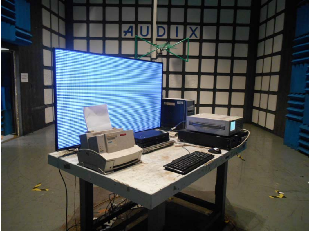
SETUP WITH MAXIMUM DETECTED EMISSION AT HORIZONTAL POLARIZATION (TEST MODE: USB PLAY)