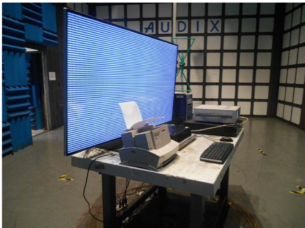
SETUP WITH MAXIMUM DETECTED EMISSION AT VERTICAL POLARIZATION (TEST MODE: HDMI 1920*1080@60Hz)