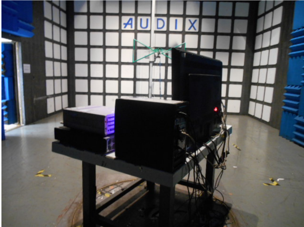
SETUP WITH MAXIMUM DETECTED EMISSION AT HORIZONTAL POLARIZATION (TEST MODE: HDMI 1920*1080@60Hz)