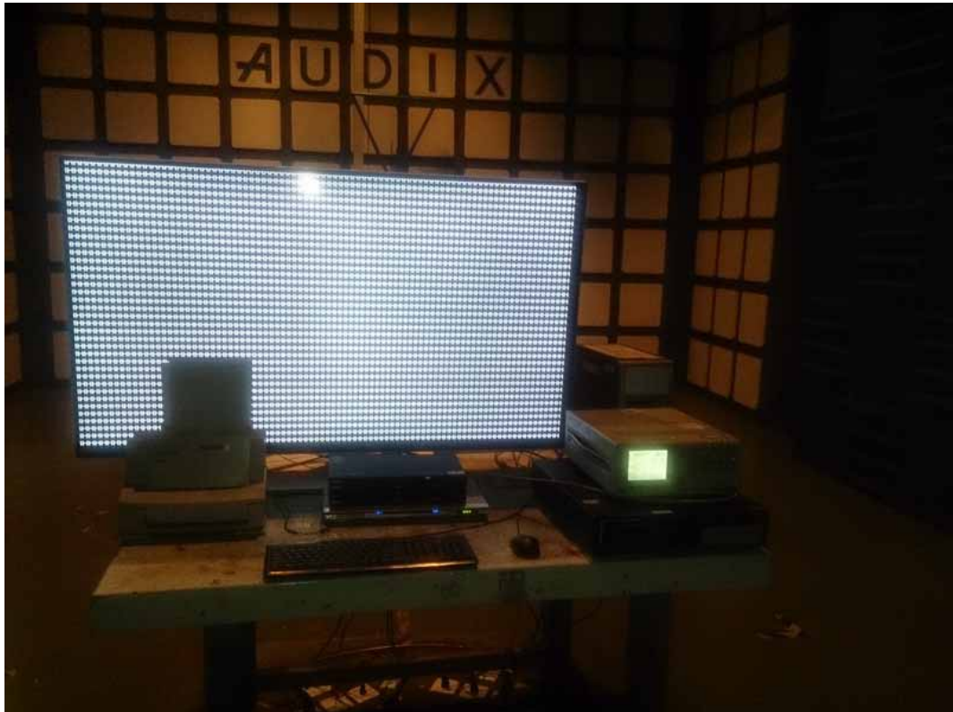
FRONT VIEW OF RADIATED EMISSION TEST