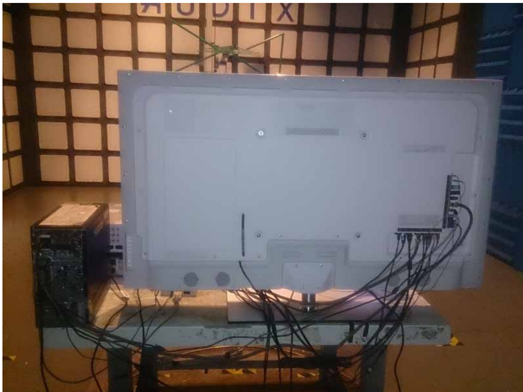
BACK VIEW OF RADIATED EMISSION TEST