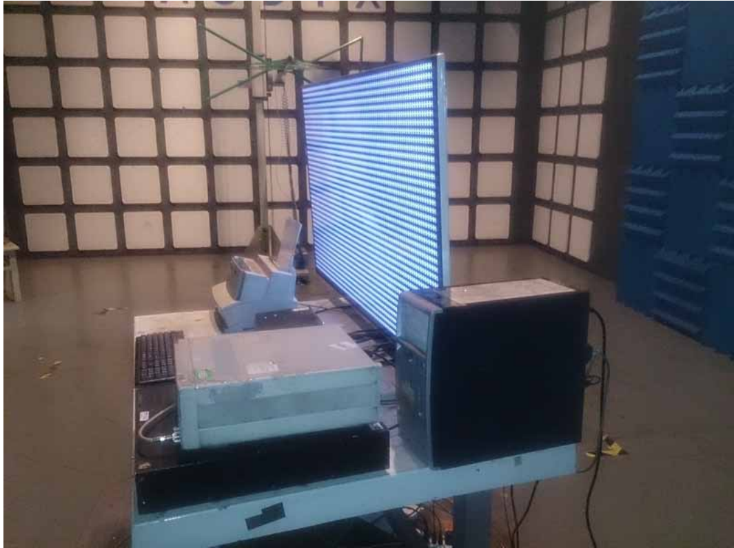
SETUP WITH MAXIMUM DETECTED EMISSION AT HORIZONTAL POLARIZATION (TEST MODE: HDMI 1920*1080@60Hz)