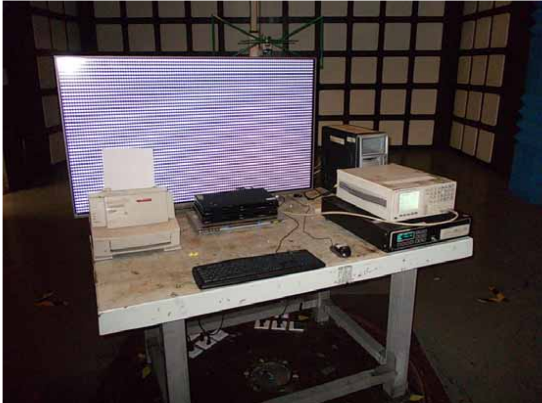
SETUP WITH MAXIMUM DETECTED EMISSION AT HORIZONTAL POLARIZATION (TEST MODE: HDMI 1920*1080@60Hz)