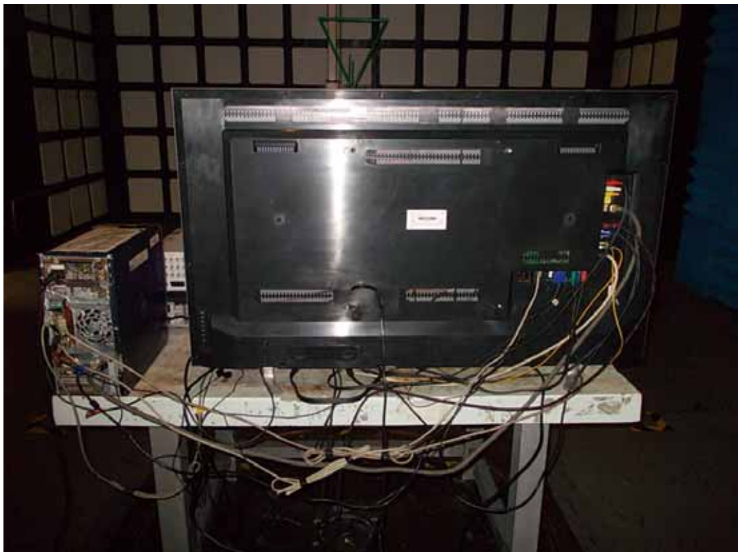
BACK VIEW OF RADIATED EMISSION TEST