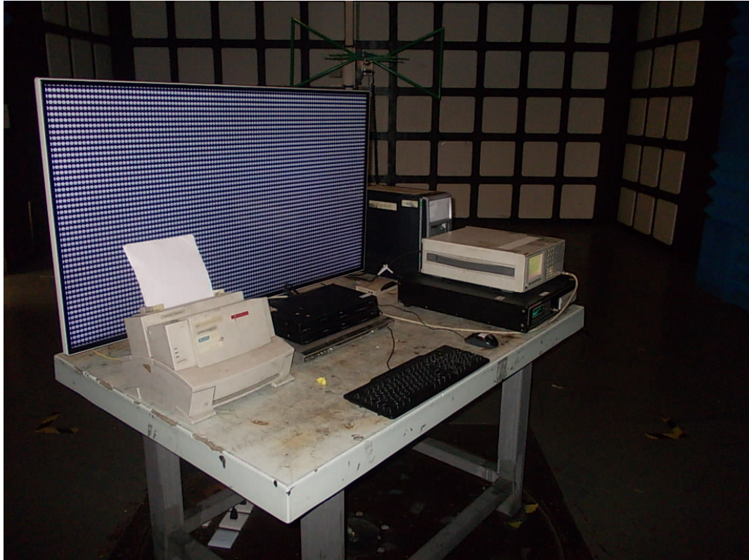
SETUP WITH MAXIMUM DETECTED EMISSION AT HORIZONTAL POLARIZATION (TEST MODE: HDMI 1920*1080@60Hz)