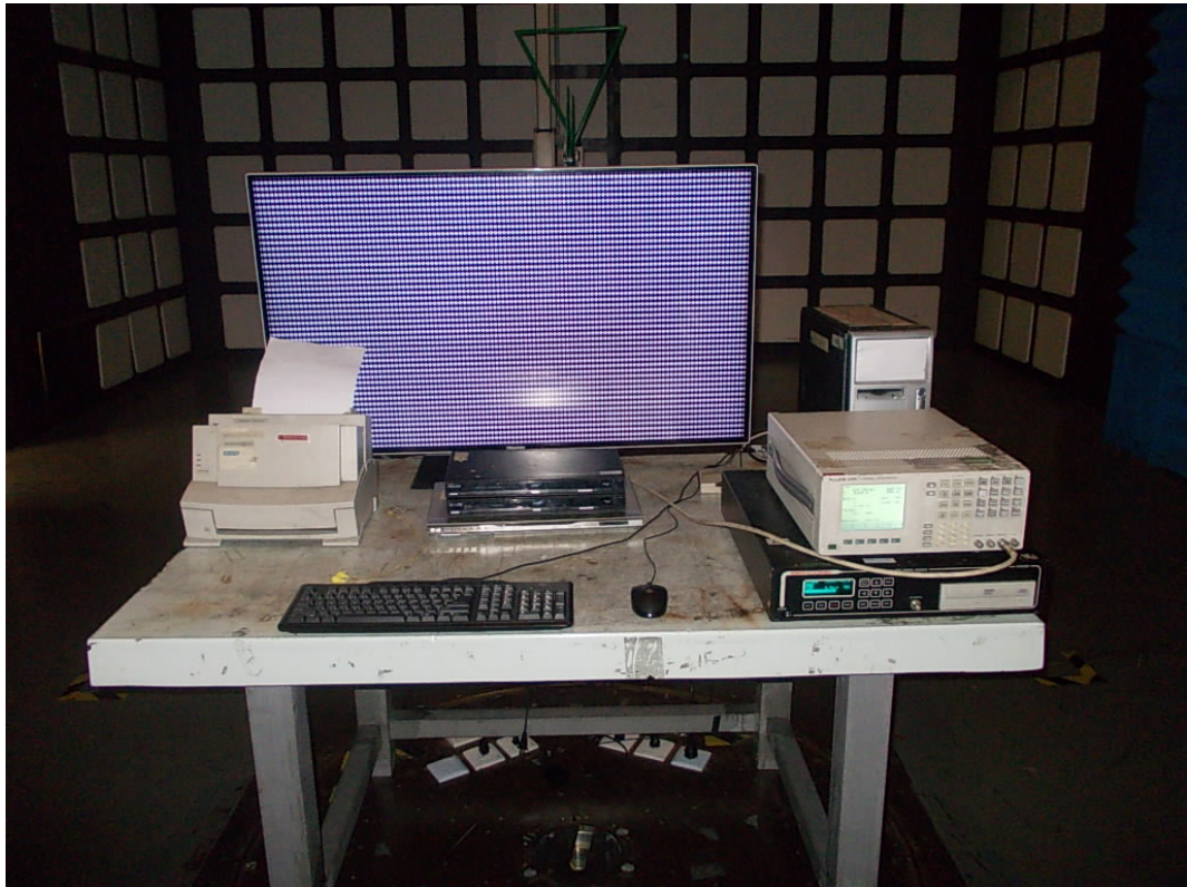
FRONT VIEW OF RADIATED EMISSION TEST