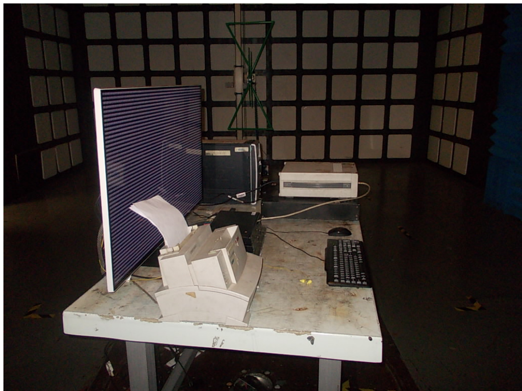
SETUP WITH MAXIMUM DETECTED EMISSION AT VERTICAL POLARIZATION (TEST MODE: HDMI 1920*1080@60Hz)