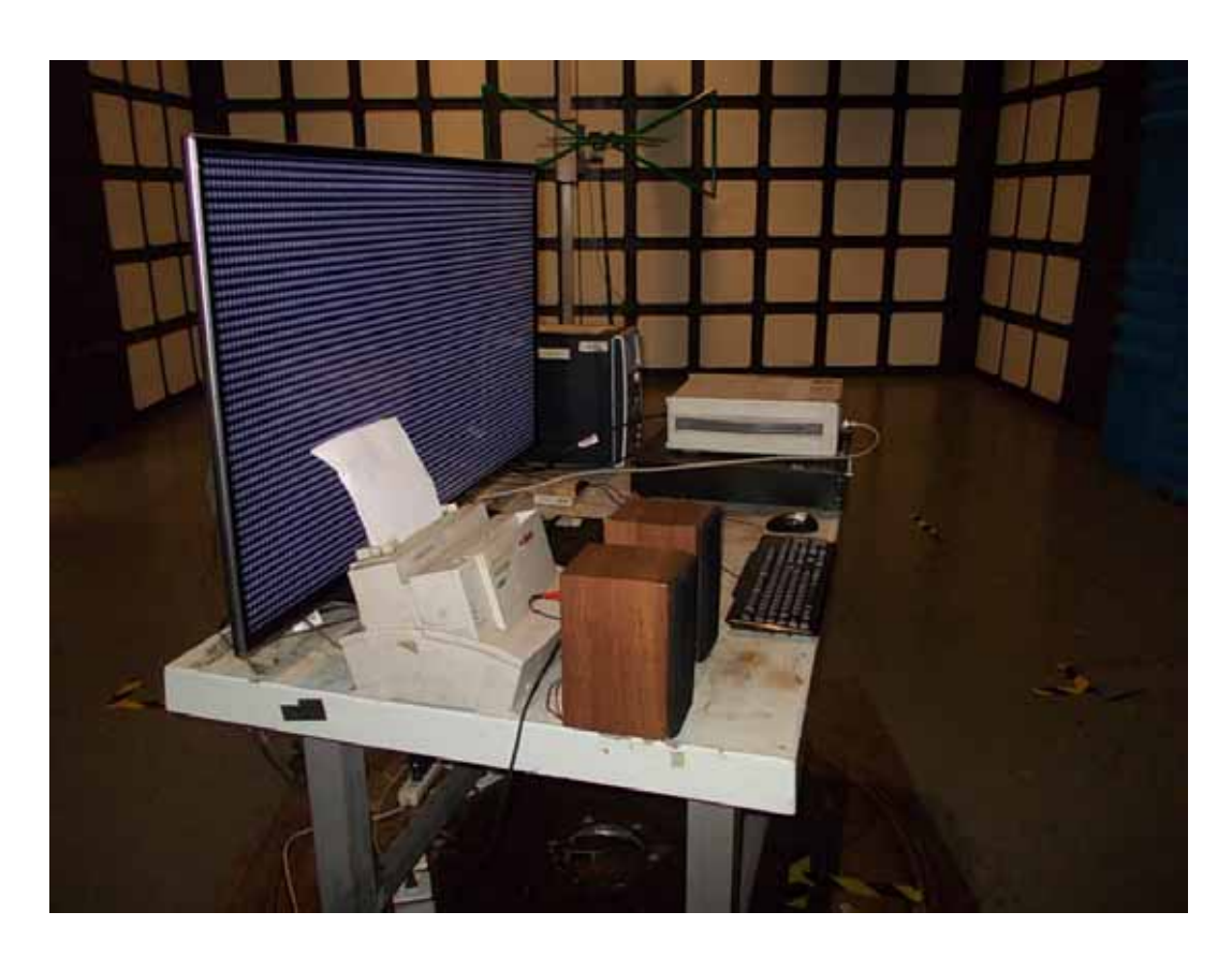
SETUP WITH MAXIMUM DETECTED EMISSION AT HORIZONTAL POLARIZATION (TEST MODE: HDMI 1920*1080@60Hz)