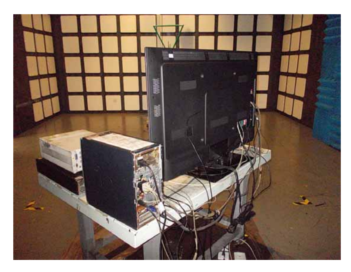
SETUP WITH MAXIMUM DETECTED EMISSION AT VERTICAL POLARIZATION (TEST MODE: HDMI 1920*1080@60Hz)