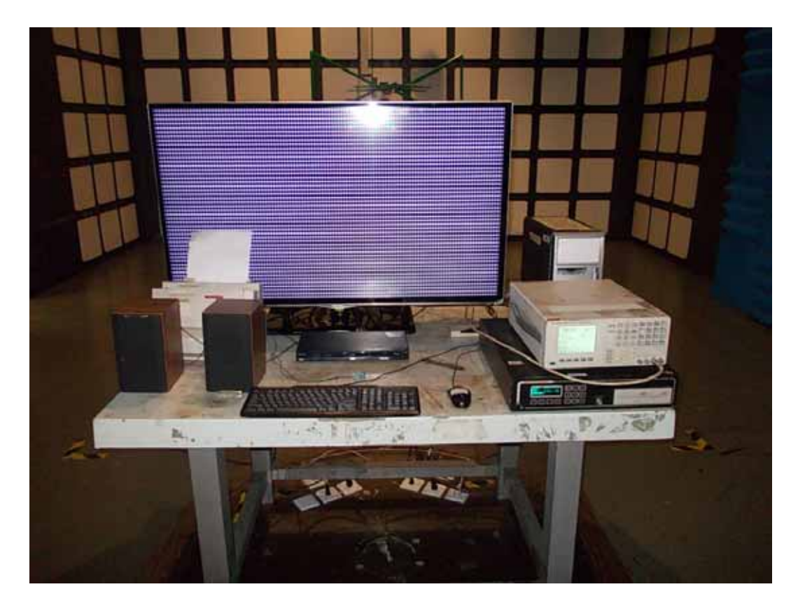
FRONT VIEW OF RADIATED EMISSION TEST