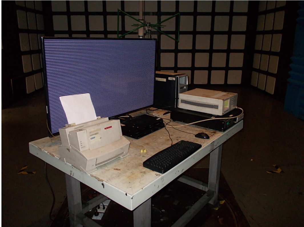
SETUP WITH MAXIMUM DETECTED EMISSION AT HORIZONTAL POLARIZATION (TEST MODE: HDMI 1920*1080@60Hz)