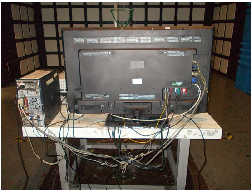
BACK VIEW OF RADIATED EMISSION TEST