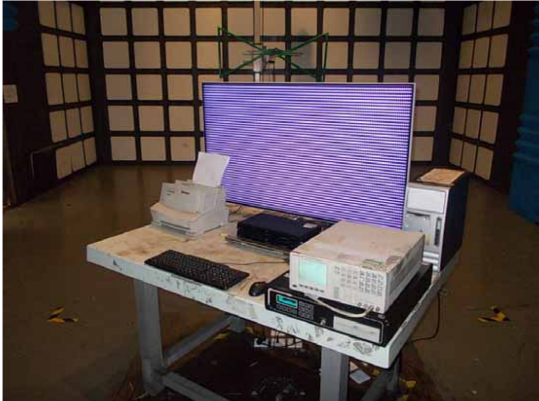
SETUP WITH MAXIMUM DETECTED EMISSION AT HORIZONTAL POLARIZATION (TEST MODE: HDMI 1920*1080@60Hz)