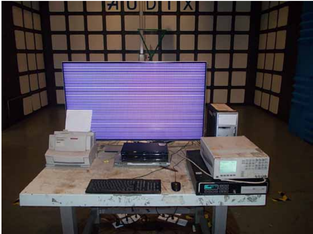
FRONT VIEW OF RADIATED EMISSION TEST