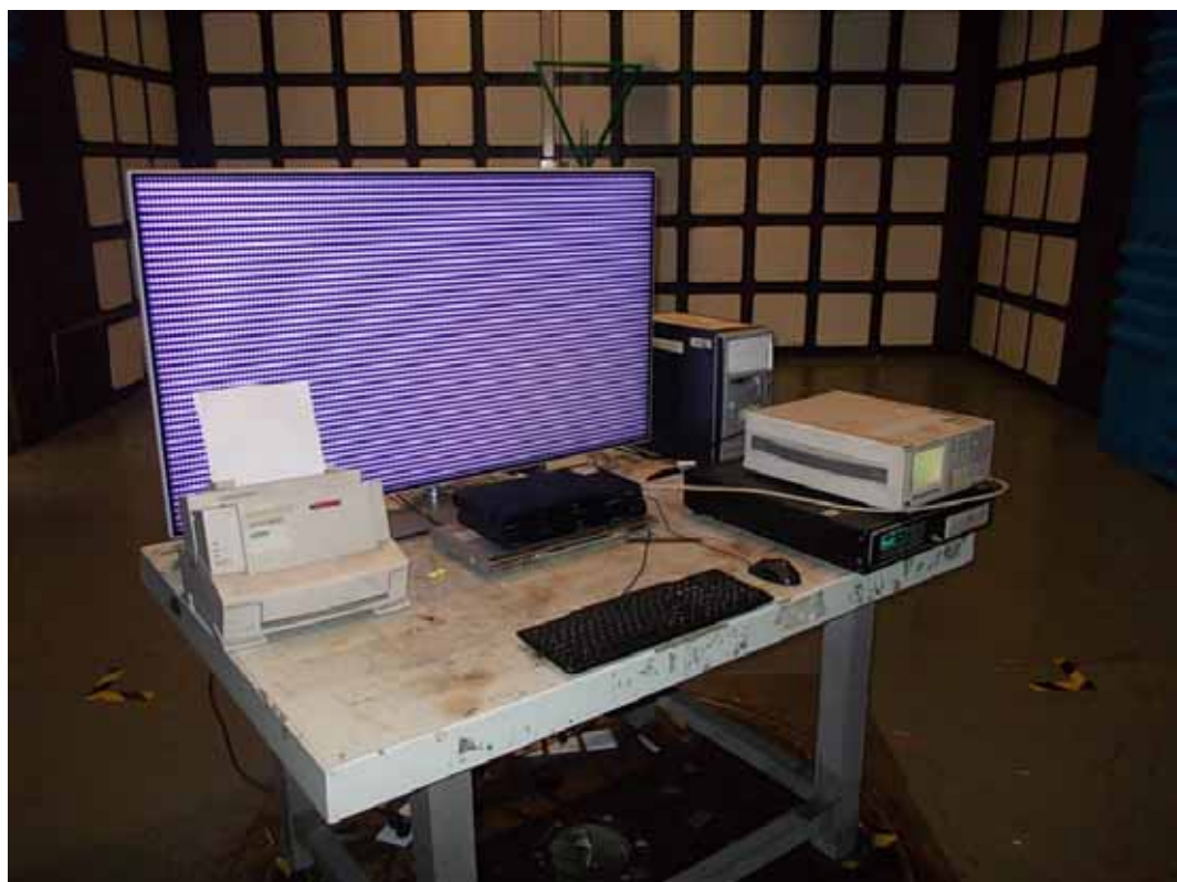
SETUP WITH MAXIMUM DETECTED EMISSION AT VERTICAL POLARIZATION (TEST MODE: HDMI 1920*1080@60Hz)