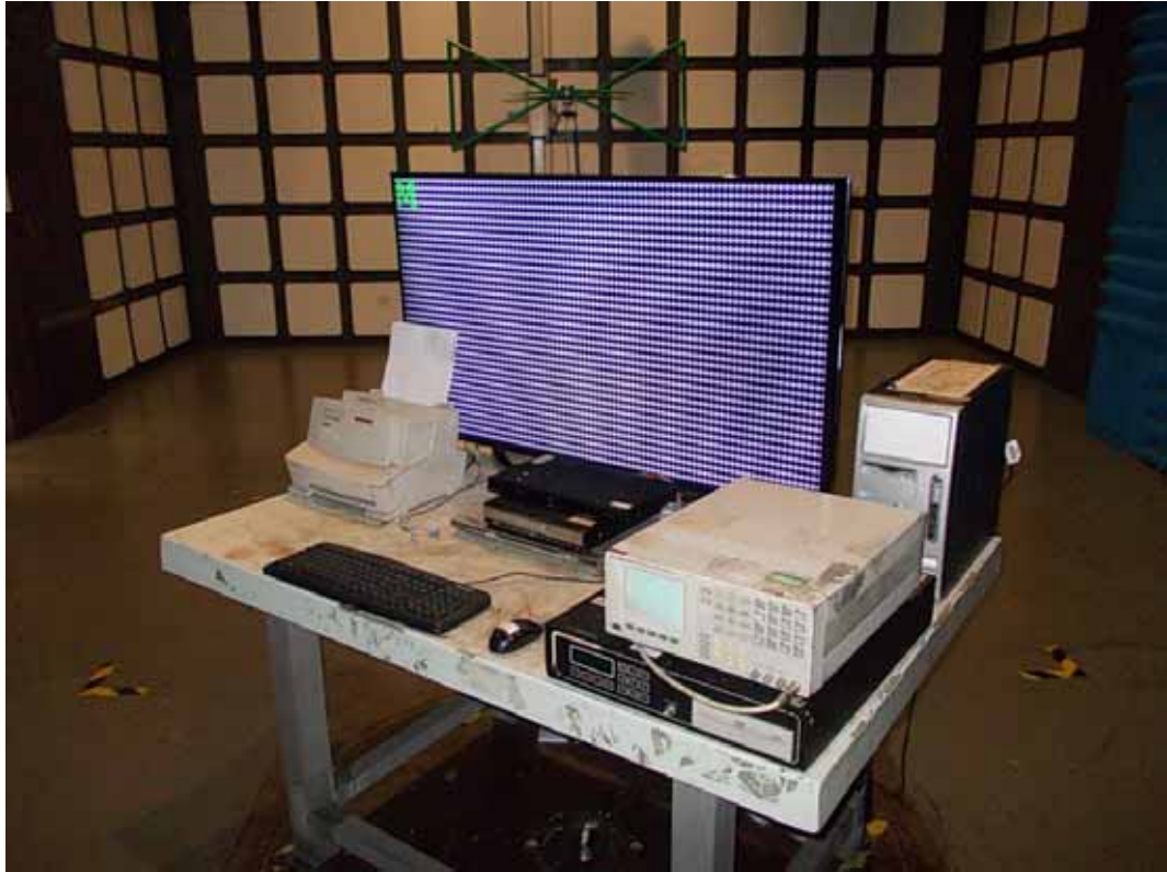
SETUP WITH MAXIMUM DETECTED EMISSION AT HORIZONTAL POLARIZATION (TEST MODE: HDMI 1920*1080@60Hz)