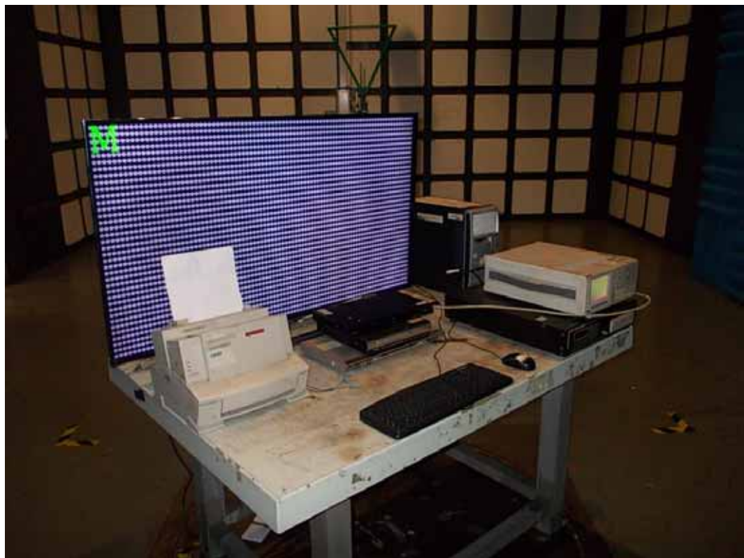
SETUP WITH MAXIMUM DETECTED EMISSION AT VERTICAL POLARIZATION (TEST MODE: HDMI 1920*1080@60Hz)