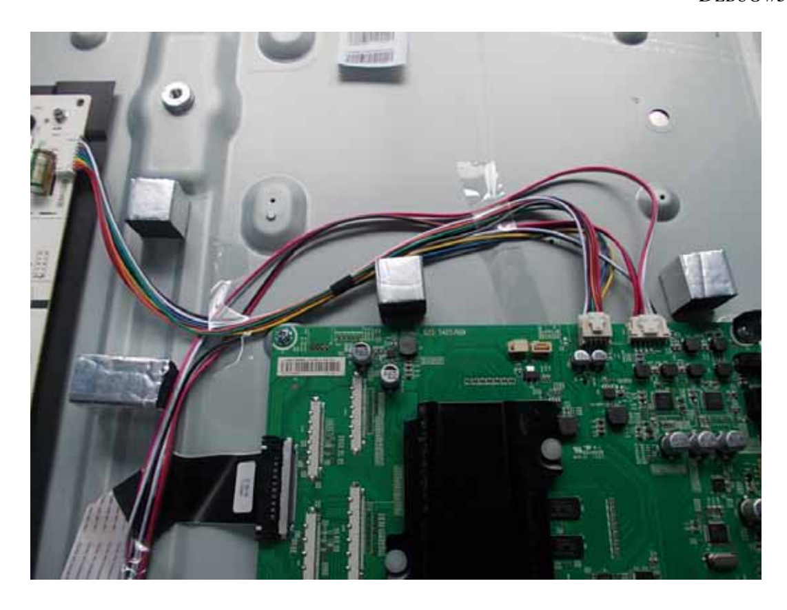
FIGURE 29 LED LCD TV (M/N: LTDN55XT880WUS) DEBUG #6