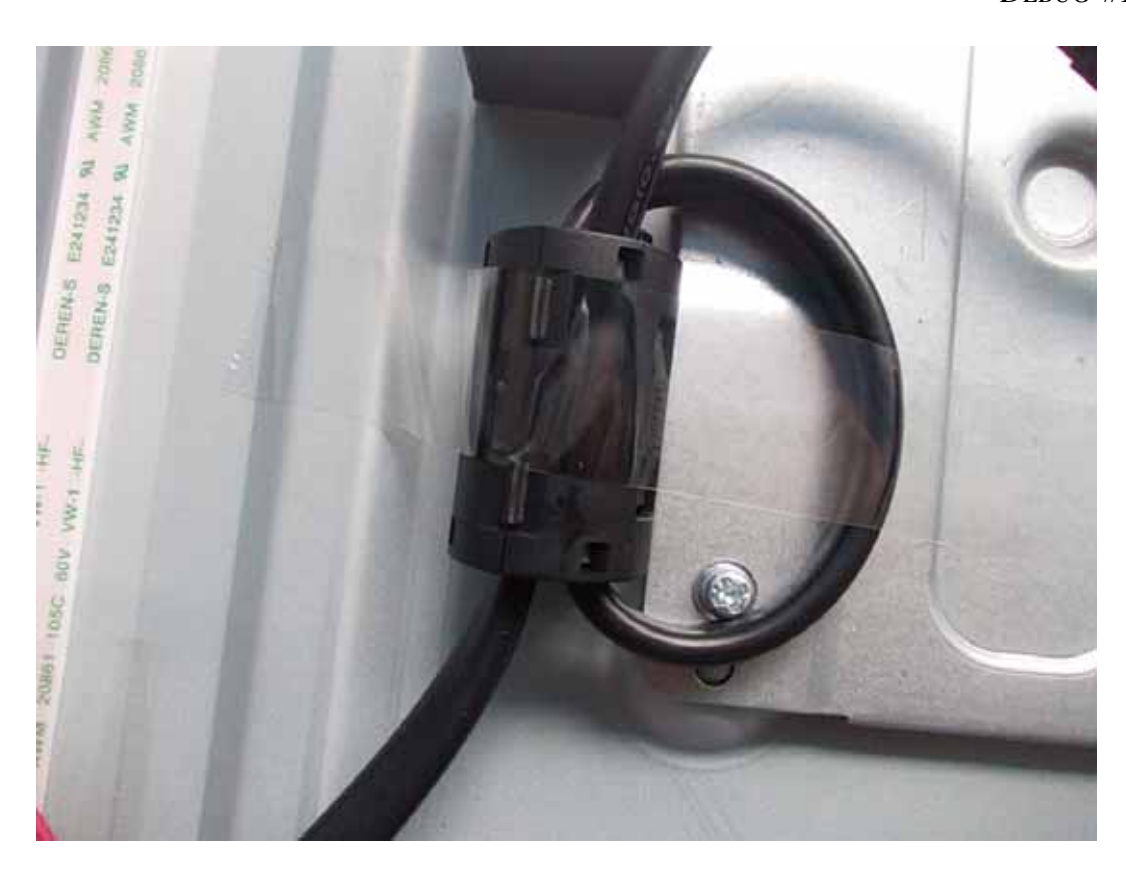
FIGURE 25 LED LCD TV (M/N: LTDN55XT880WUS) DEBUG #2