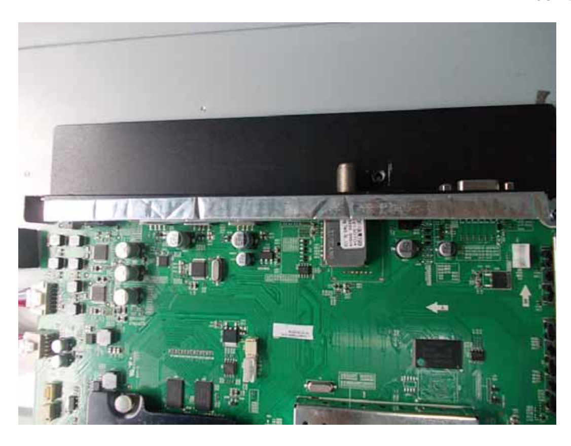
FIGURE 27 LED LCD TV (M/N: LTDN55XT880WUS) DEBUG #4