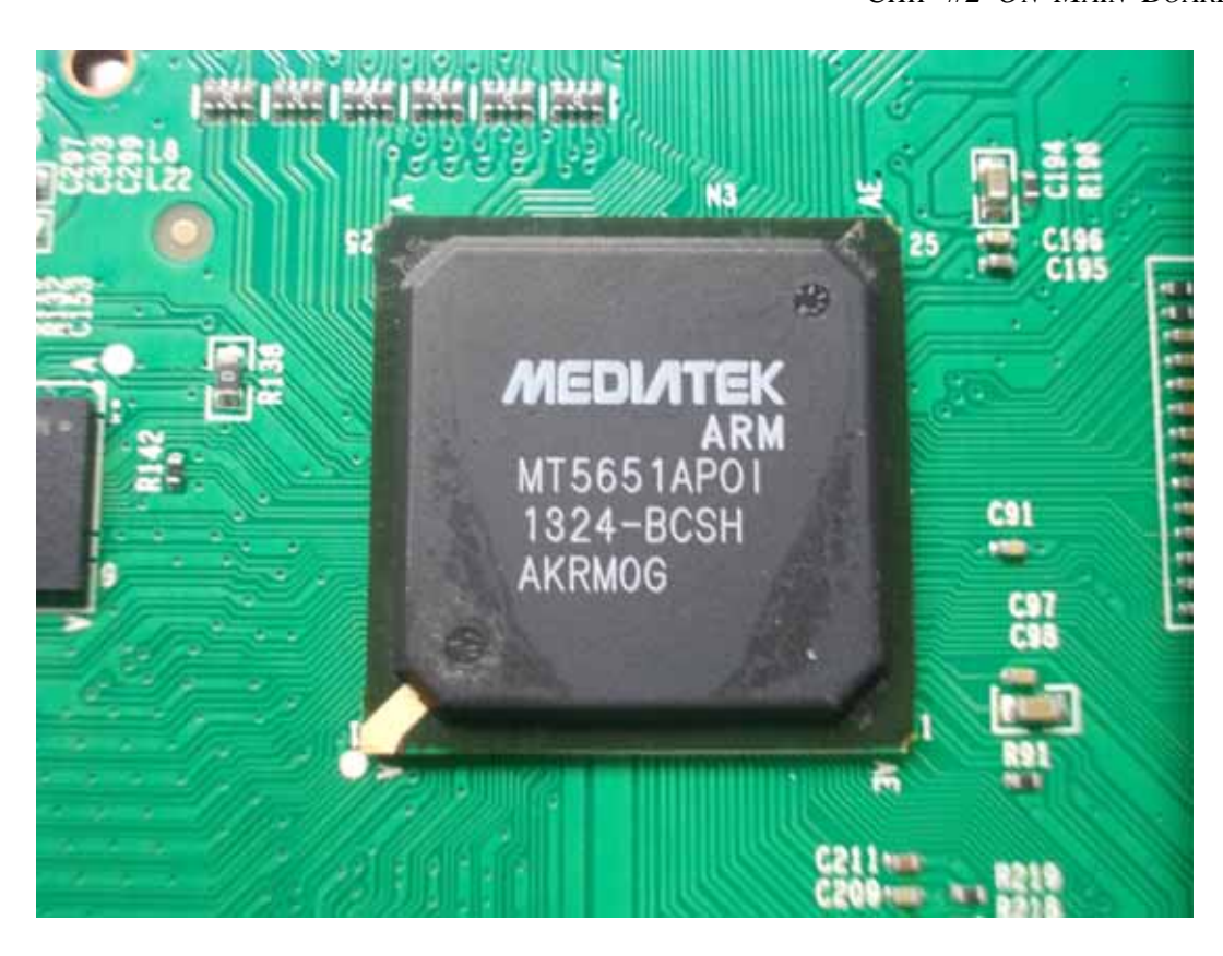
FIGURE 10 LED LCD TV (M/N: LTDN55XT880WUS) CRYSTAL #1 ON MAIN BOARD