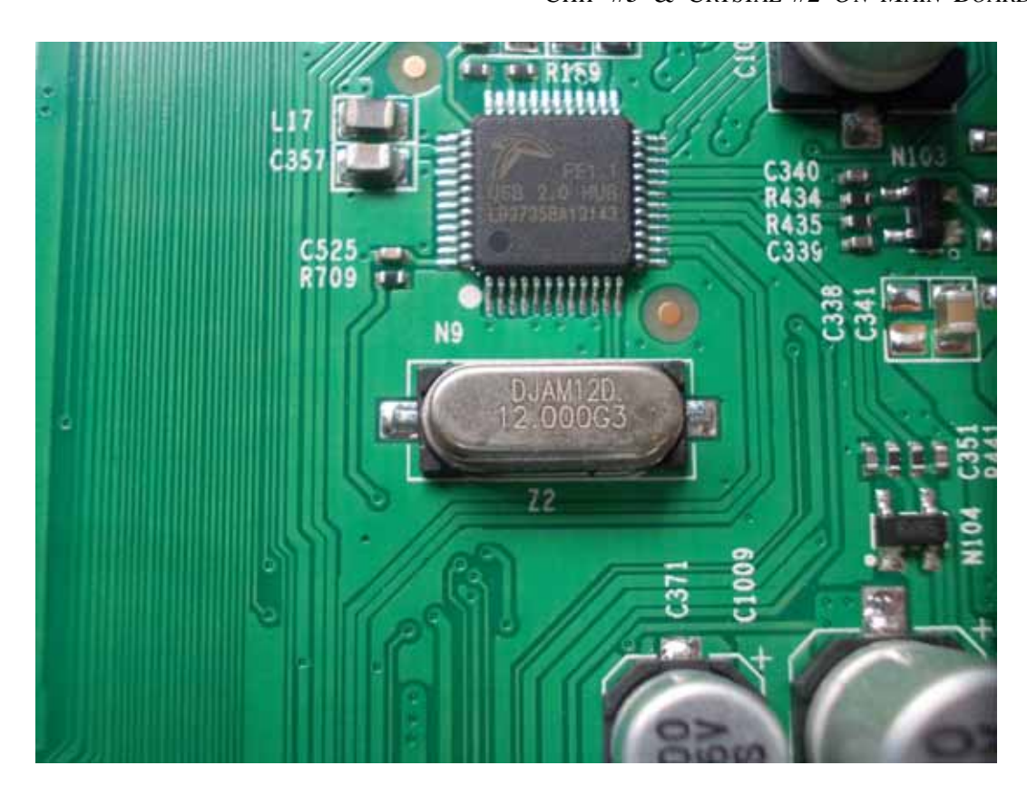
FIGURE 12 LED LCD TV (M/N: LTDN55XT880WUS) CRYSTAL #3 ON MAIN BOARD