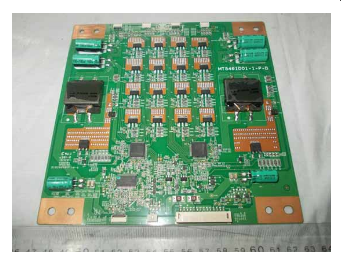
FIGURE 23 LED LCD TV (M/N: LTDN55XT880WUS) BOARD #2 (SOLDERED SIDE)