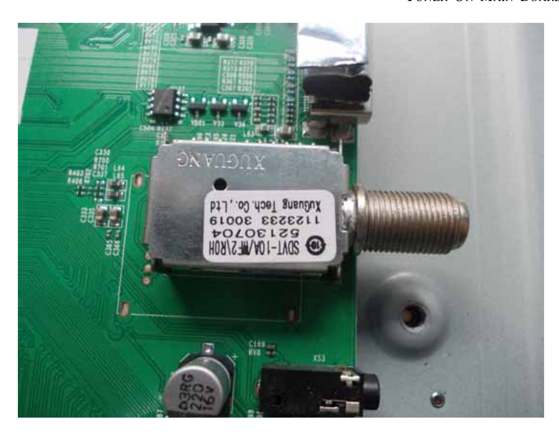
FIGURE 8 LED LCD TV (M/N: LTDN55XT880WUS) CHIP #1 ON MAIN BOARD