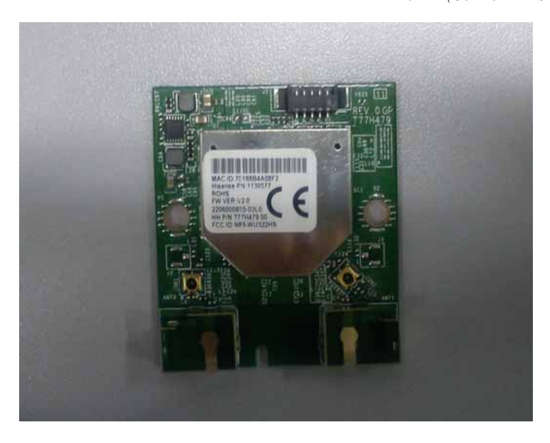
FIGURE 19 LED LCD TV (M/N: LTDN55XT880WUS) RF BOARD (SOLDERED SIDE)