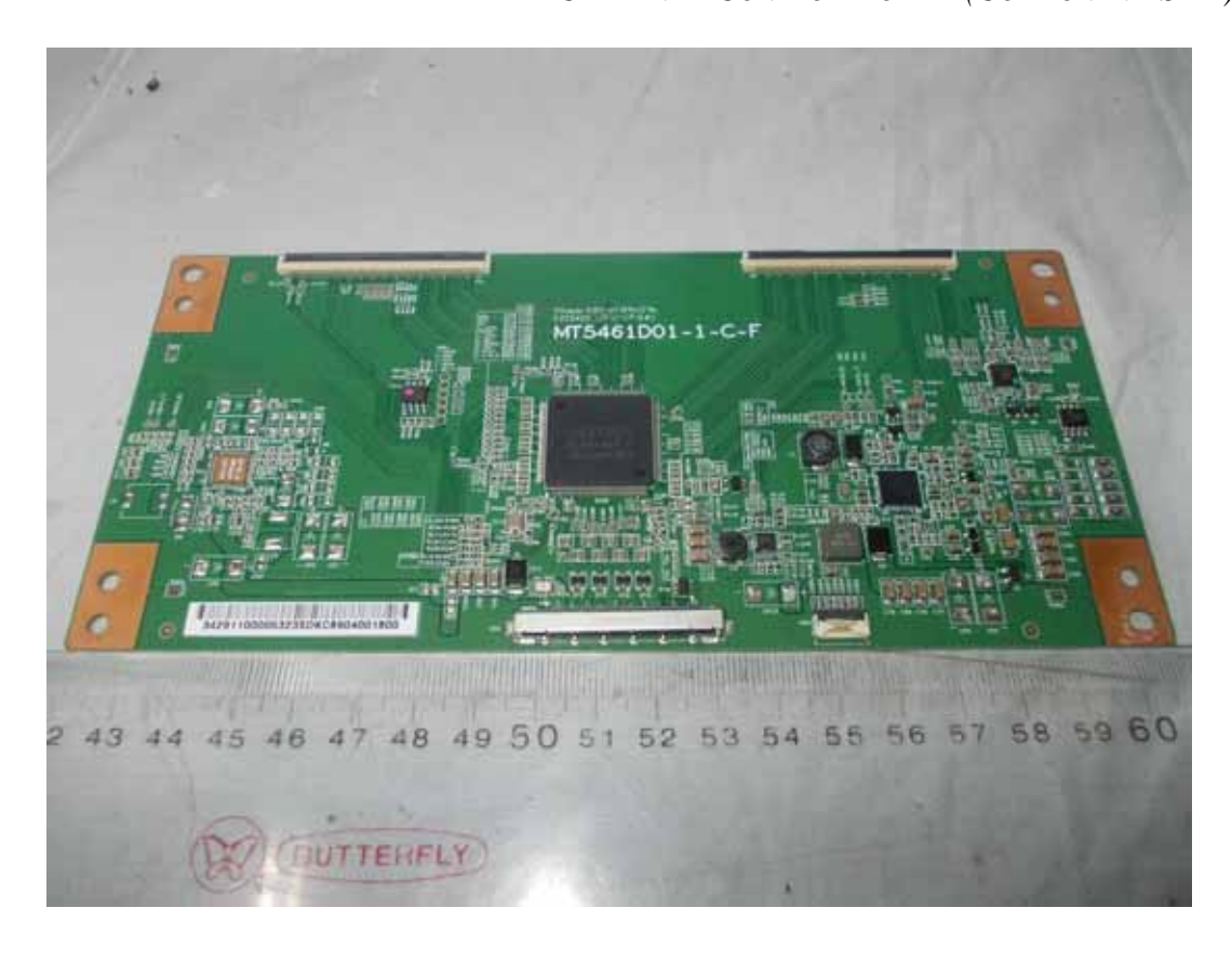
FIGURE 14 LED LCD TV (M/N: LTDN55XT880WUS) LCD PANEL CONTROL BOARD (SOLDERED SIDE)