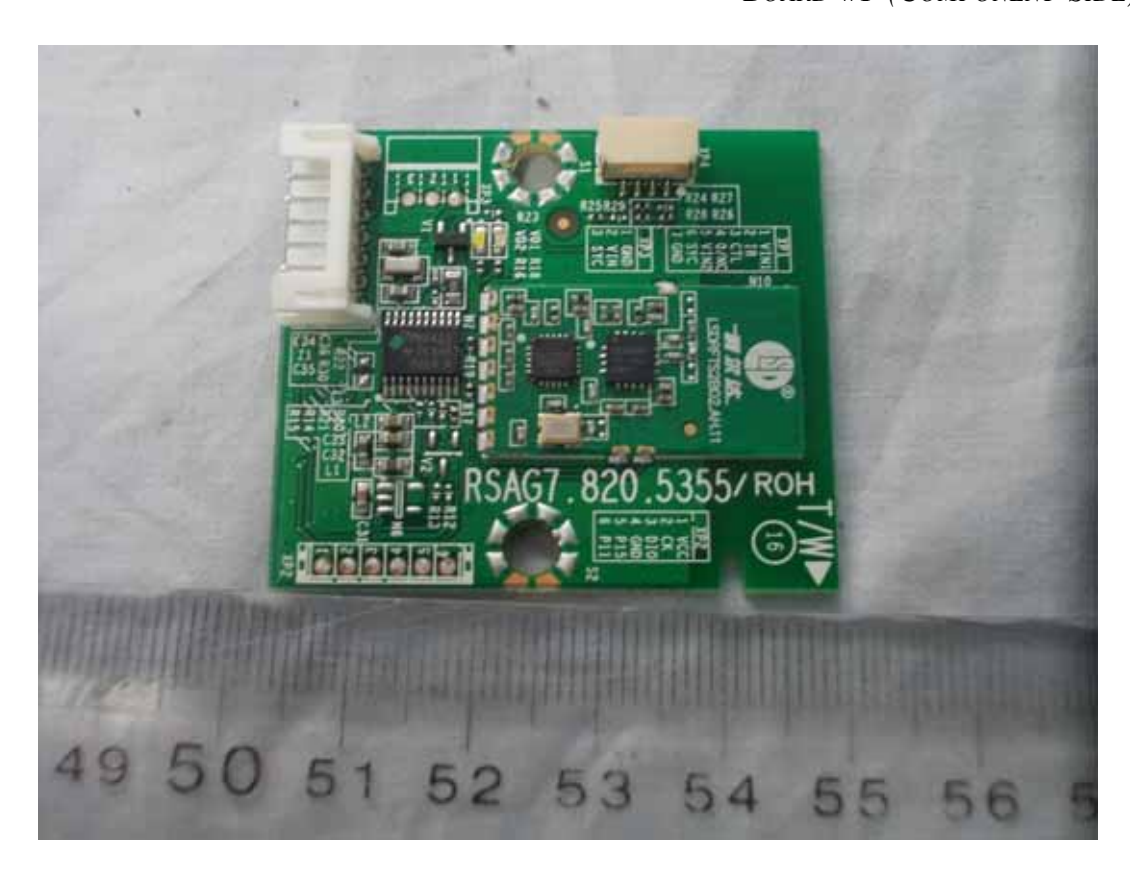
FIGURE 21 LED LCD TV (M/N: LTDN55XT880WUS) BOARD #1 (SOLDERED SIDE)