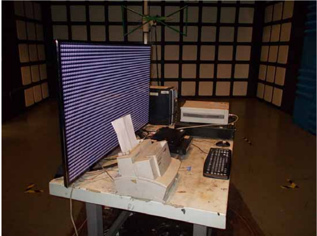
SETUP WITH MAXIMUM DETECTED EMISSION AT HORIZONTAL POLARIZATION (TEST MODE: HDMI 3840*2160@30Hz (UHD))