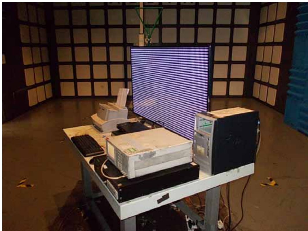
SETUP WITH MAXIMUM DETECTED EMISSION AT VERTICAL POLARIZATION (TEST MODE: HDMI 3840*2160@30Hz (UHD))