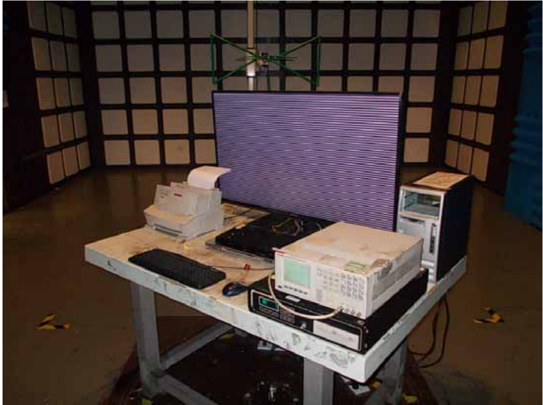
SETUP WITH MAXIMUM DETECTED EMISSION AT HORIZONTAL POLARIZATION (TEST MODE: D-SUB 1920*1080@60Hz)