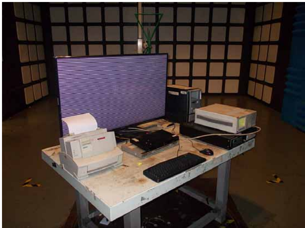
SETUP WITH MAXIMUM DETECTED EMISSION AT VERTICAL POLARIZATION (TEST MODE: D-SUB 1920*1080@60Hz)