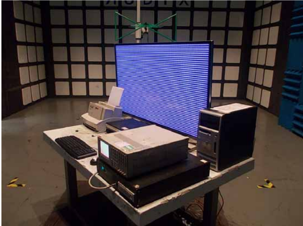
SETUP WITH MAXIMUM DETECTED EMISSION AT HORIZONTAL POLARIZATION (TEST MODE: D-SUB 640*480@60Hz)