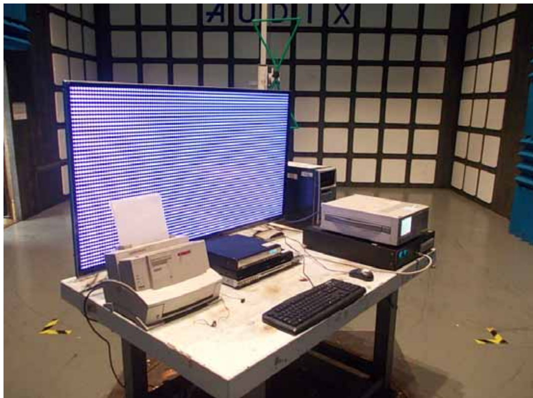
SETUP WITH MAXIMUM DETECTED EMISSION AT VERTICAL POLARIZATION (TEST MODE: D-SUB 640*480@60Hz)