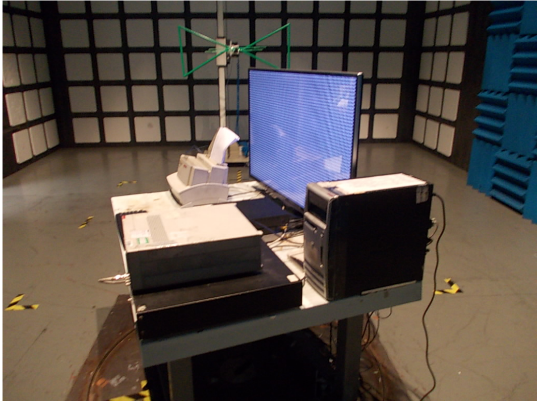
SETUP WITH MAXIMUM DETECTED EMISSION AT HORIZONTAL POLARIZATION (TEST MODE: D-SUB 1024*768@60Hz)