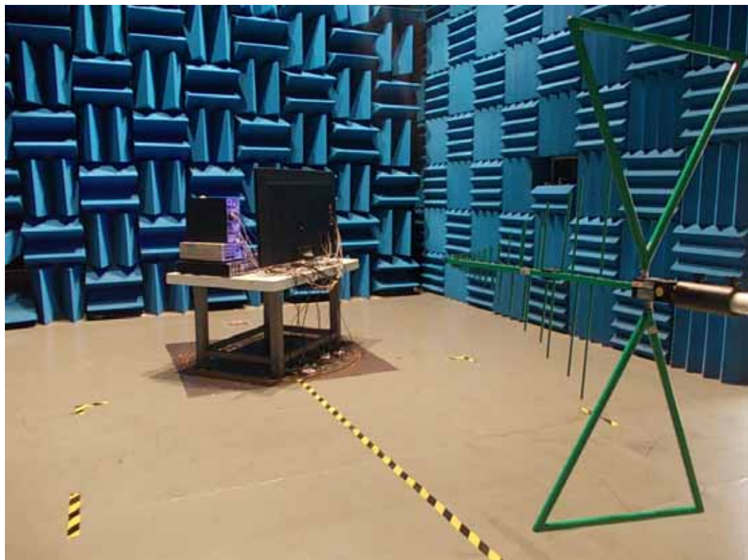
SETUP WITH MAXIMUM DETECTED EMISSION AT VERTICAL POLARIZATION (TEST MODE: D-SUB 1024*768@60Hz)