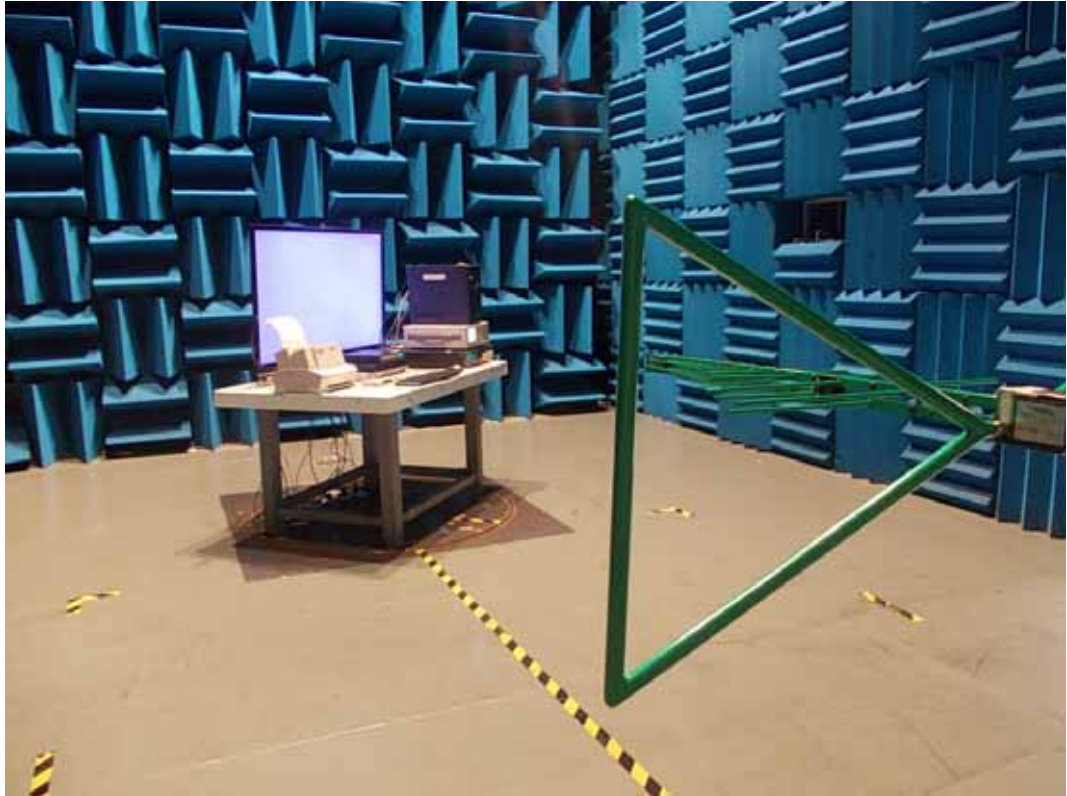
SETUP WITH MAXIMUM DETECTED EMISSION AT HORIZONTAL POLARIZATION (TEST MODE: D-SUB 1024*768@60Hz)