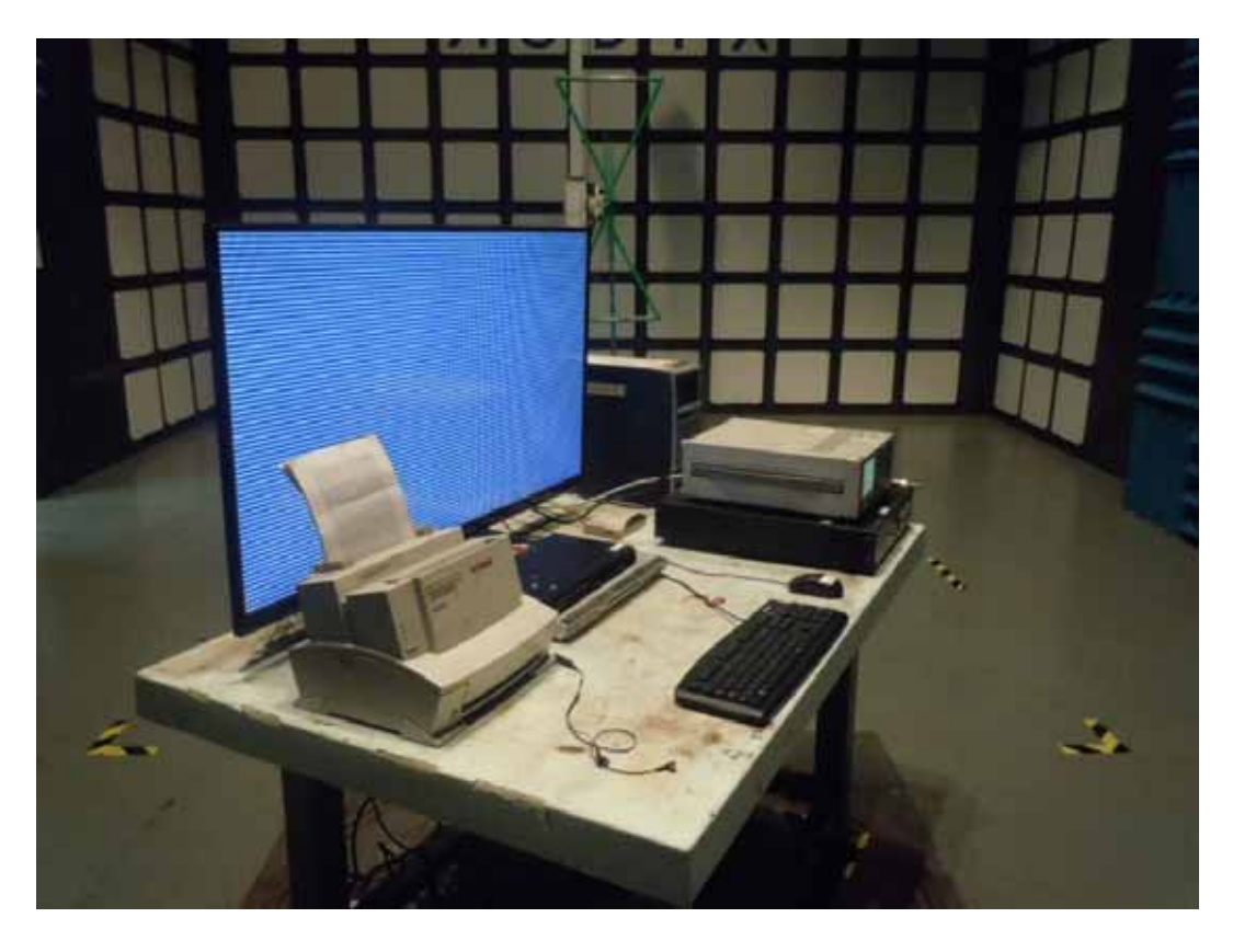
Setup with Maximum Detected Emission at Vertical Polarization (Test mode: D-Sub 1024*768@60Hz)