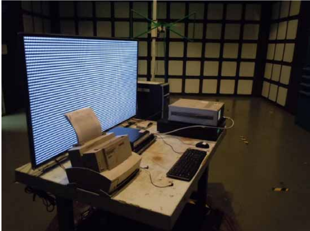
SETUP WITH MAXIMUM DETECTED EMISSION AT HORIZONTAL POLARIZATION (TEST MODE: HDMI 1024*768@60Hz)