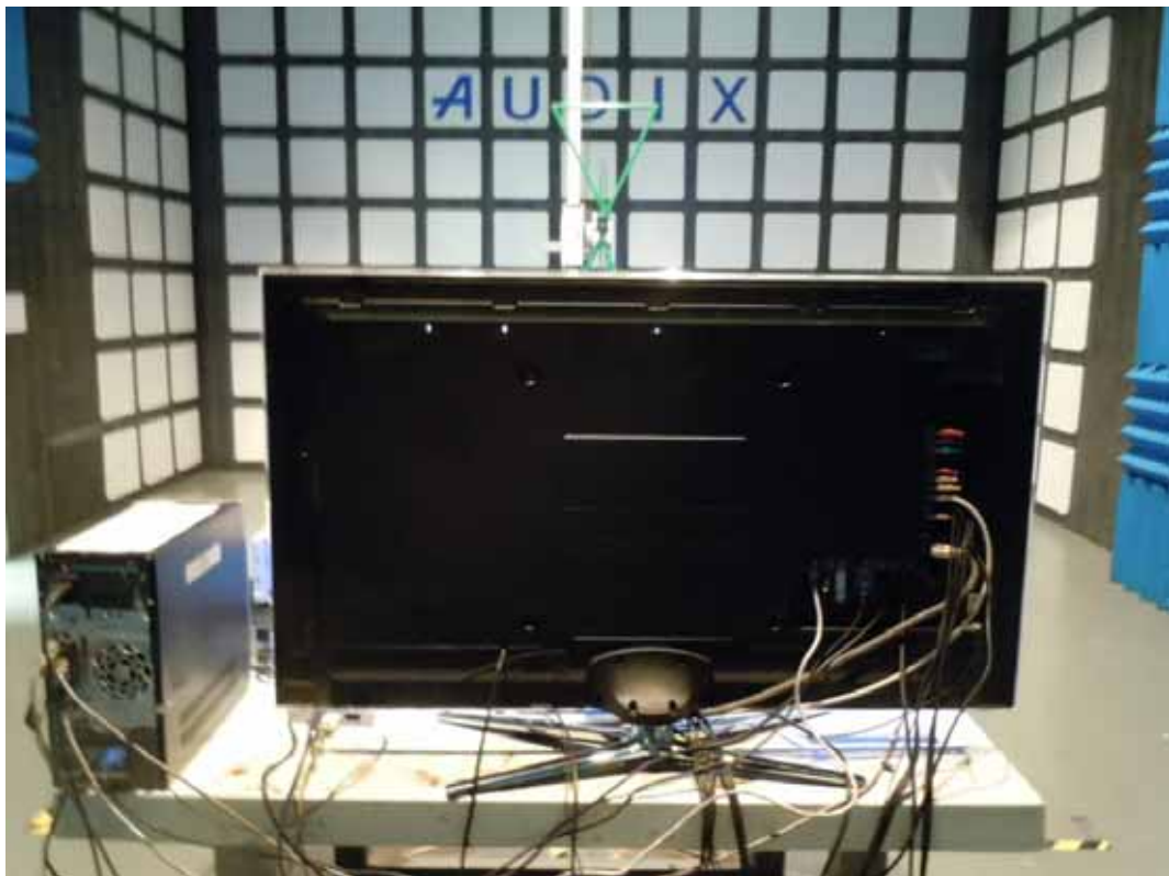
BACK VIEW OF RADIATED EMISSION TEST