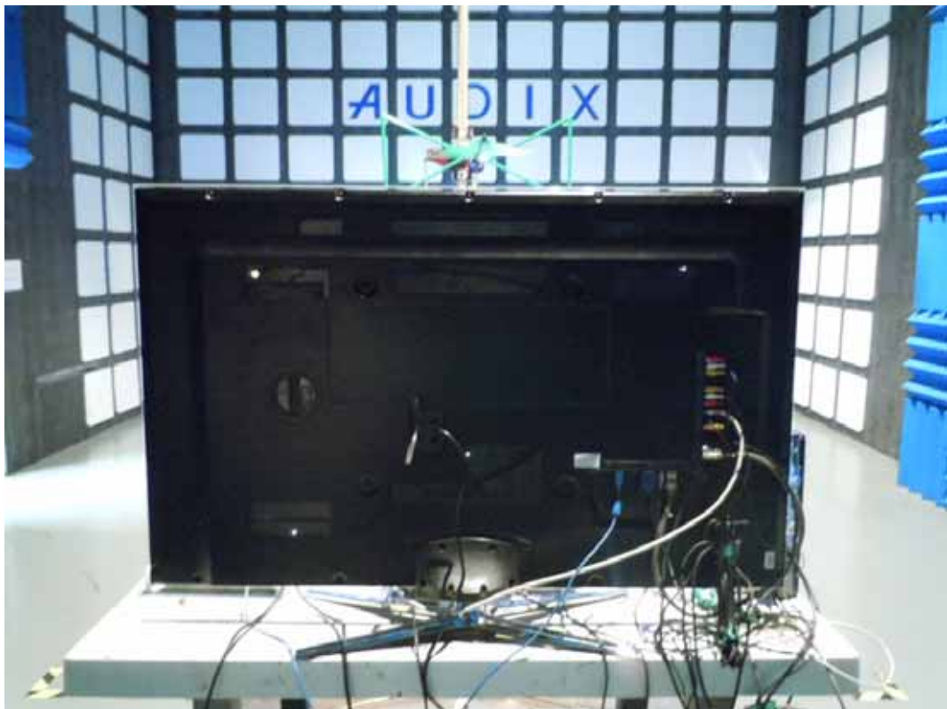
BACK VIEW OF RADIATED EMISSION TEST