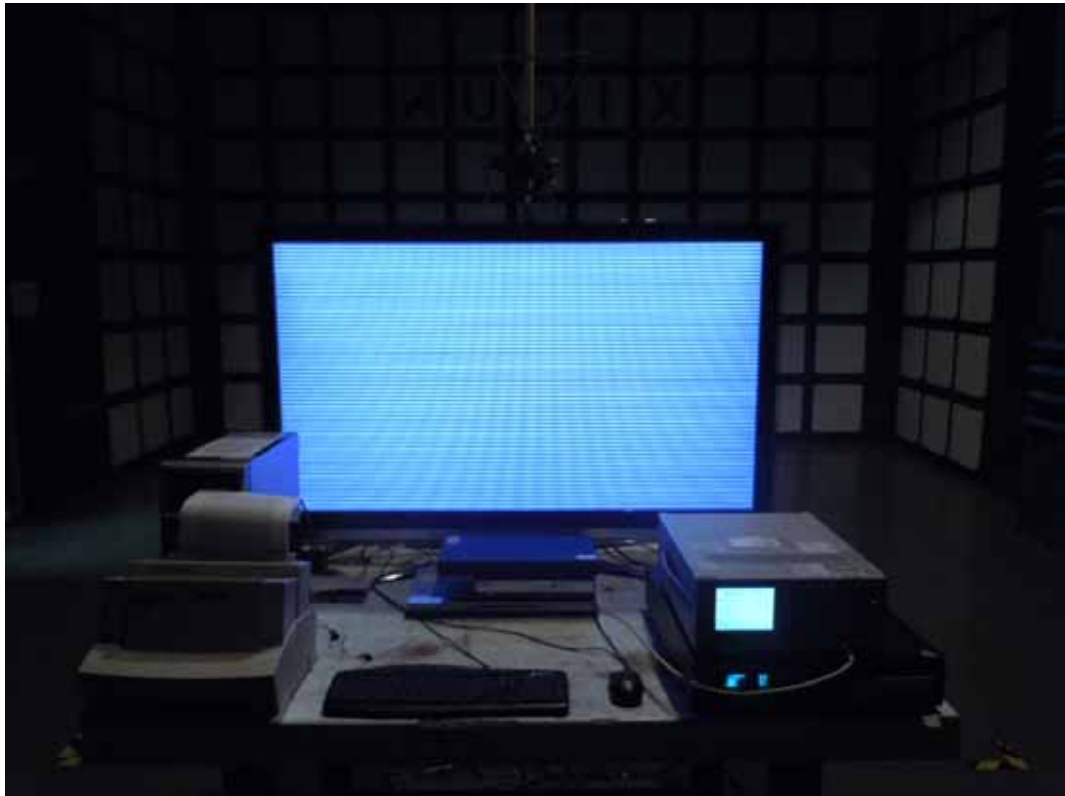
FRONT VIEW OF RADIATED EMISSION TEST