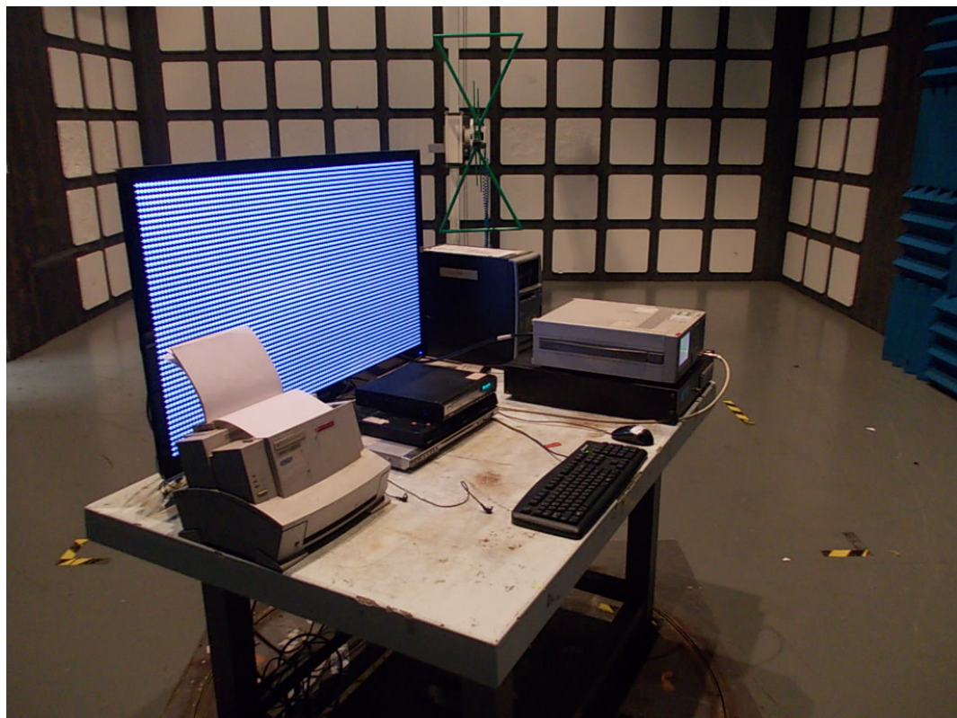
SETUP WITH MAXIMUM DETECTED EMISSION AT VERTICAL POLARIZATION (TEST MODE: D-SUB 640*480@60Hz)