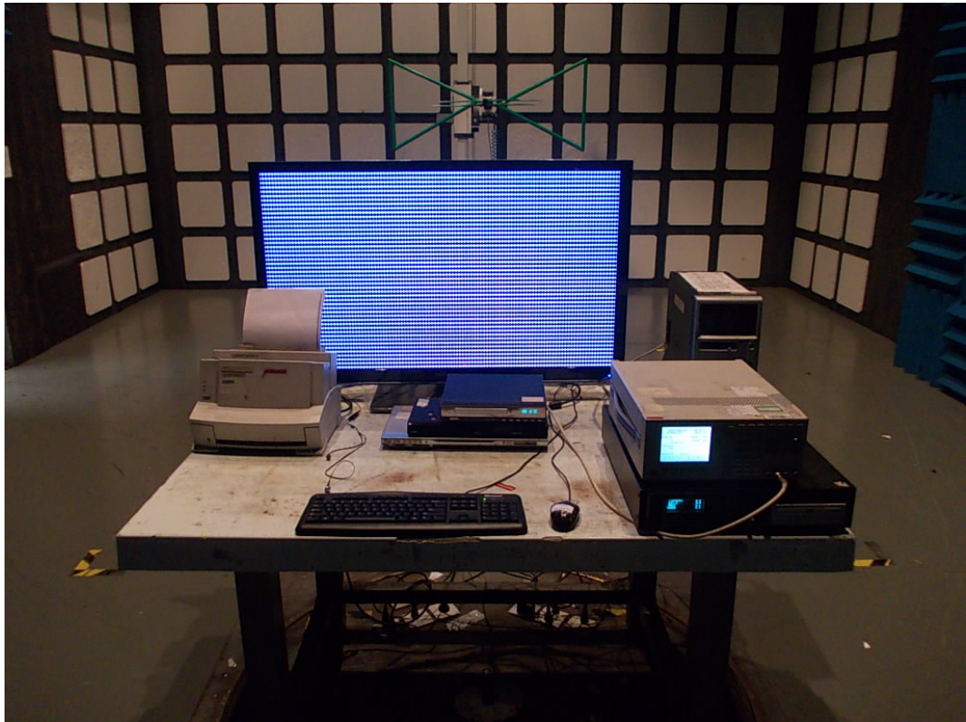
FRONT VIEW OF RADIATED EMISSION TEST