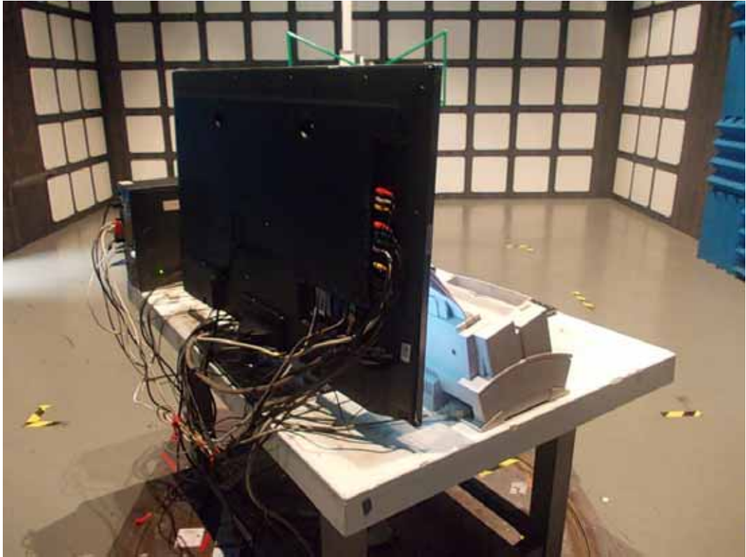
SETUP WITH MAXIMUM DETECTED EMISSION AT HORIZONTAL POLARIZATION (TEST MODE: D-SUB 800*600@60Hz)