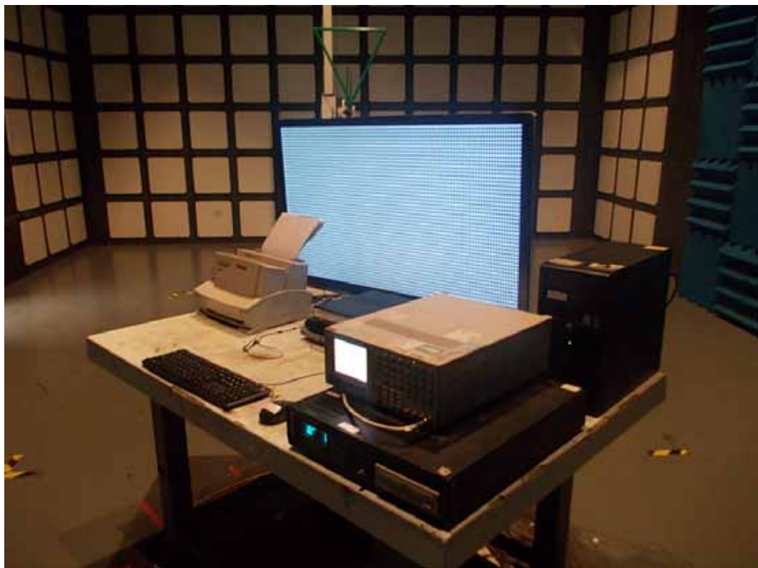
SETUP WITH MAXIMUM DETECTED EMISSION AT VERTICAL POLARIZATION (TEST MODE: D-SUB 800*600@60Hz)