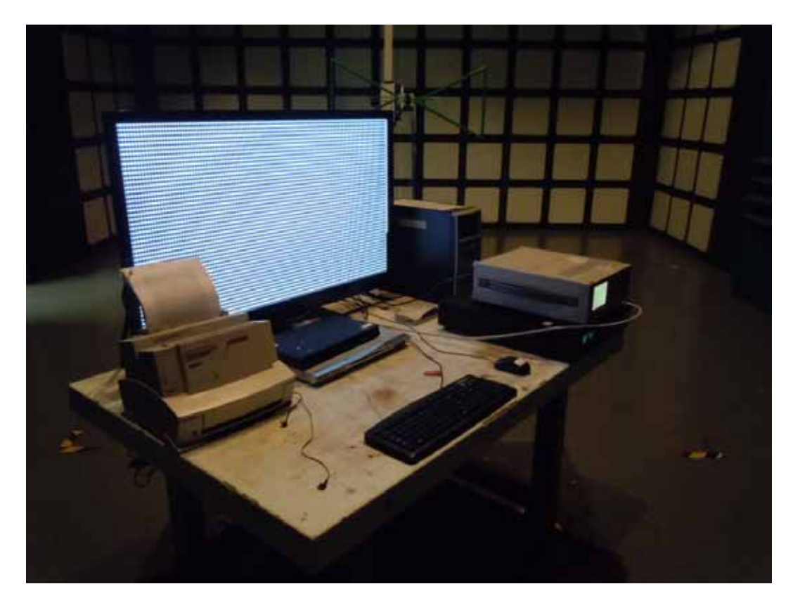
Setup with Maximum Detected Emission at Horizontal Polarization (Test mode: D-Sub 1024*768@60Hz)