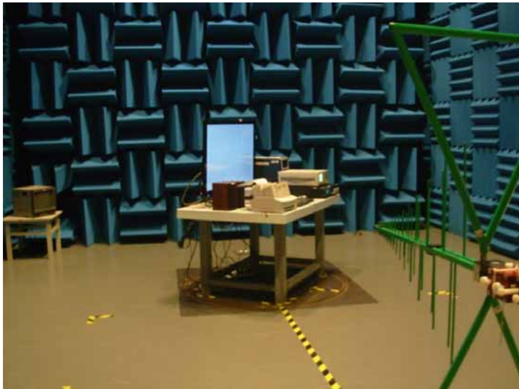
SETUP WITH MAXIMUM DETECTED EMISSION AT VERTICAL POLARIZATION (D-SUB 1280*1024@60Hz)