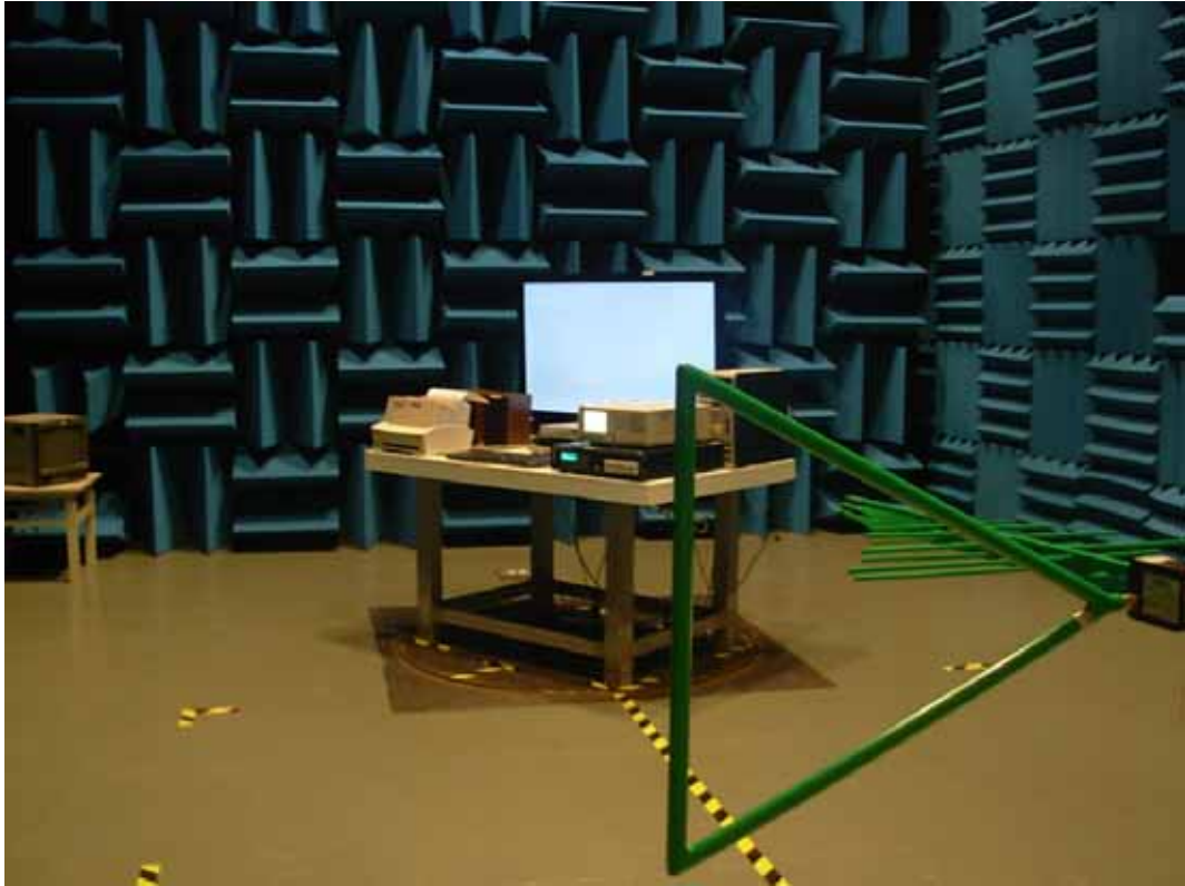
SETUP WITH MAXIMUM DETECTED EMISSION AT HORIZONTAL POLARIZATION (D-SUB 1280*1024@60Hz)