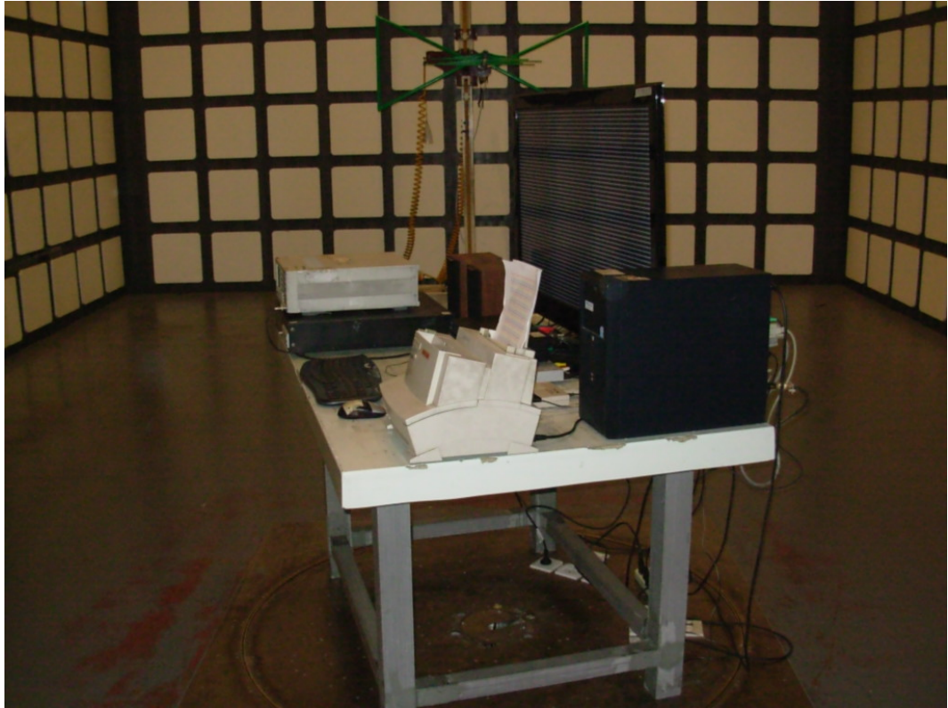
SETUP WITH MAXIMUM DETECTED EMISSION AT HORIZONTAL POLARIZATION (HDMI 1024*768@60Hz)