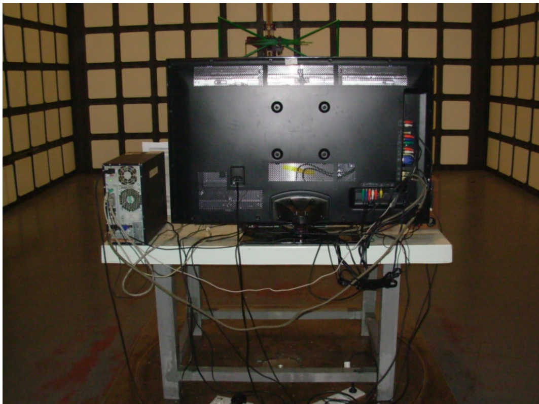
BACK VIEW OF RADIATED EMISSION TEST