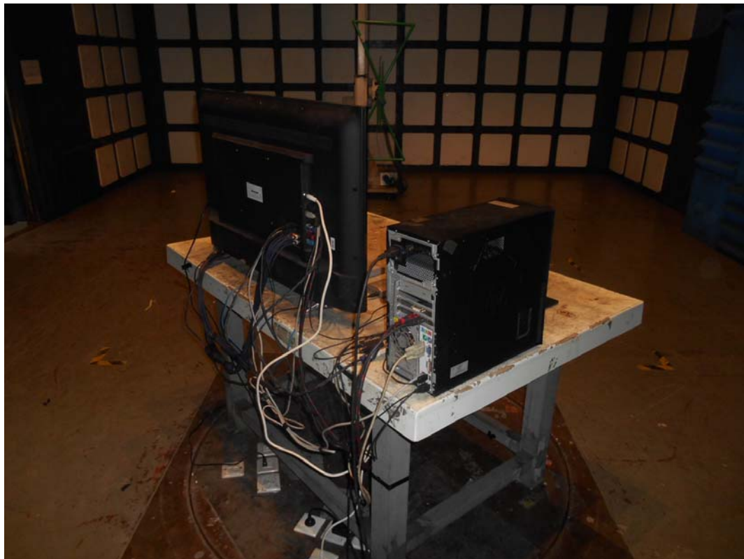
SETUP WITH MAXIMUM DETECTED EMISSION AT VERTICAL POLARIZATION (TEST MODE: HDMI 3840*2160@60Hz & 1kHz PLAYING)