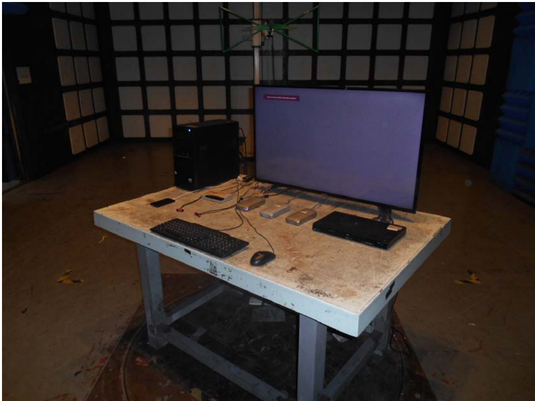
SETUP WITH MAXIMUM DETECTED EMISSION AT HORIZONTAL POLARIZATION (TEST MODE: HDMI 3840*2160@60Hz & 1kHz PLAYING)