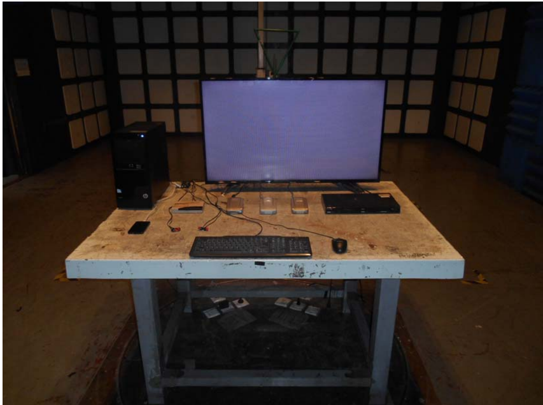
FRONT VIEW OF RADIATED EMISSION TEST (BELOW 1GHZ)