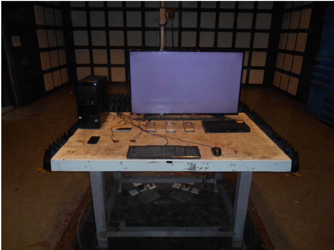
FRONT VIEW OF RADIATED EMISSION TEST (ABOVE 1GHZ)