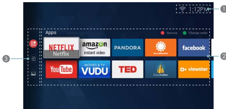
Figure 12. Home screen

The menus are only for reference, may vary slightly from the actual screen.