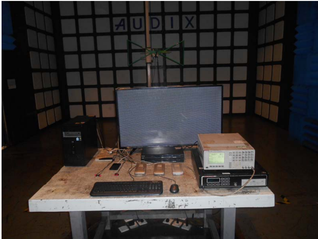
FRONT VIEW OF RADIATED EMISSION TEST (BELOW 1GHZ)