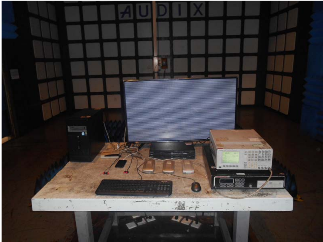
FRONT VIEW OF RADIATED EMISSION TEST (ABOVE 1GHZ)