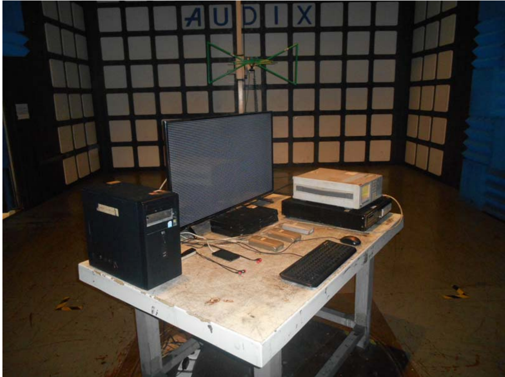
SETUP WITH MAXIMUM DETECTED EMISSION AT HORIZONTAL POLARIZATION (TEST MODE: HDMI 3840*2160@60HZ & 1KHZ PLAYING)