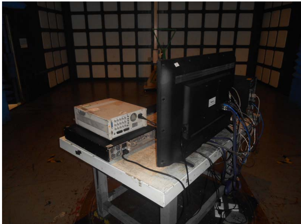
SETUP WITH MAXIMUM DETECTED EMISSION AT VERTICAL POLARIZATION (TEST MODE: HDMI 3840*2160@60HZ & 1KHZ PLAYING)