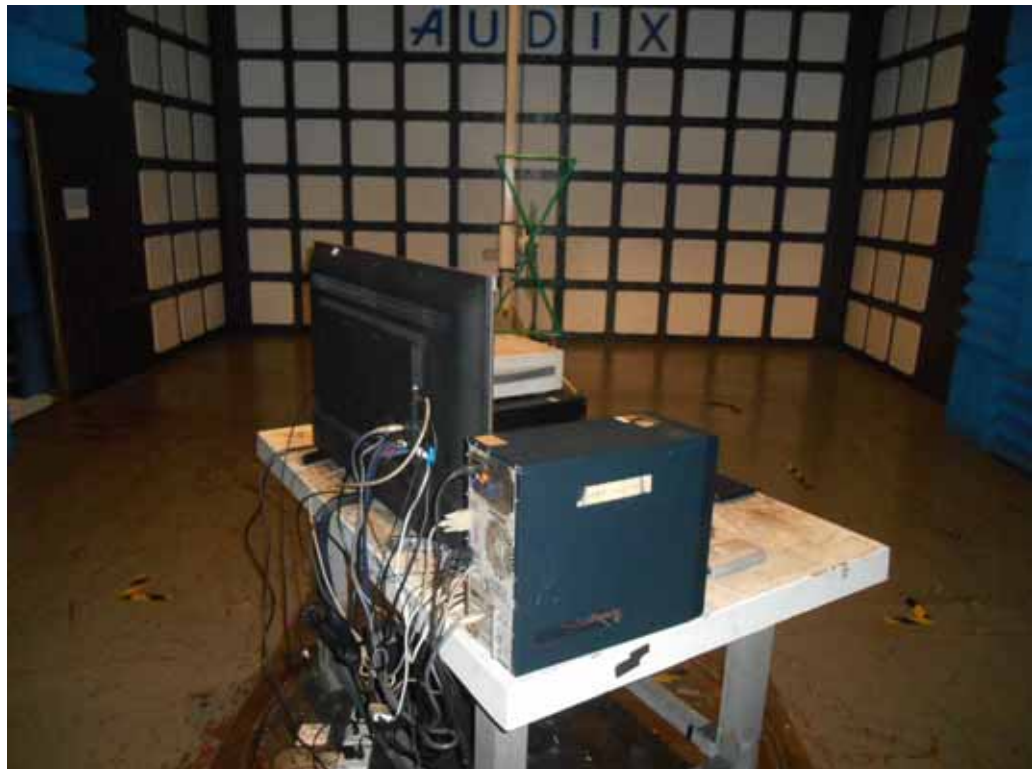
SETUP WITH MAXIMUM DETECTED EMISSION AT VERTICAL POLARIZATION (TEST MODE: HDMI 3840*2160@60HZ & 1KHZ PLAYING)