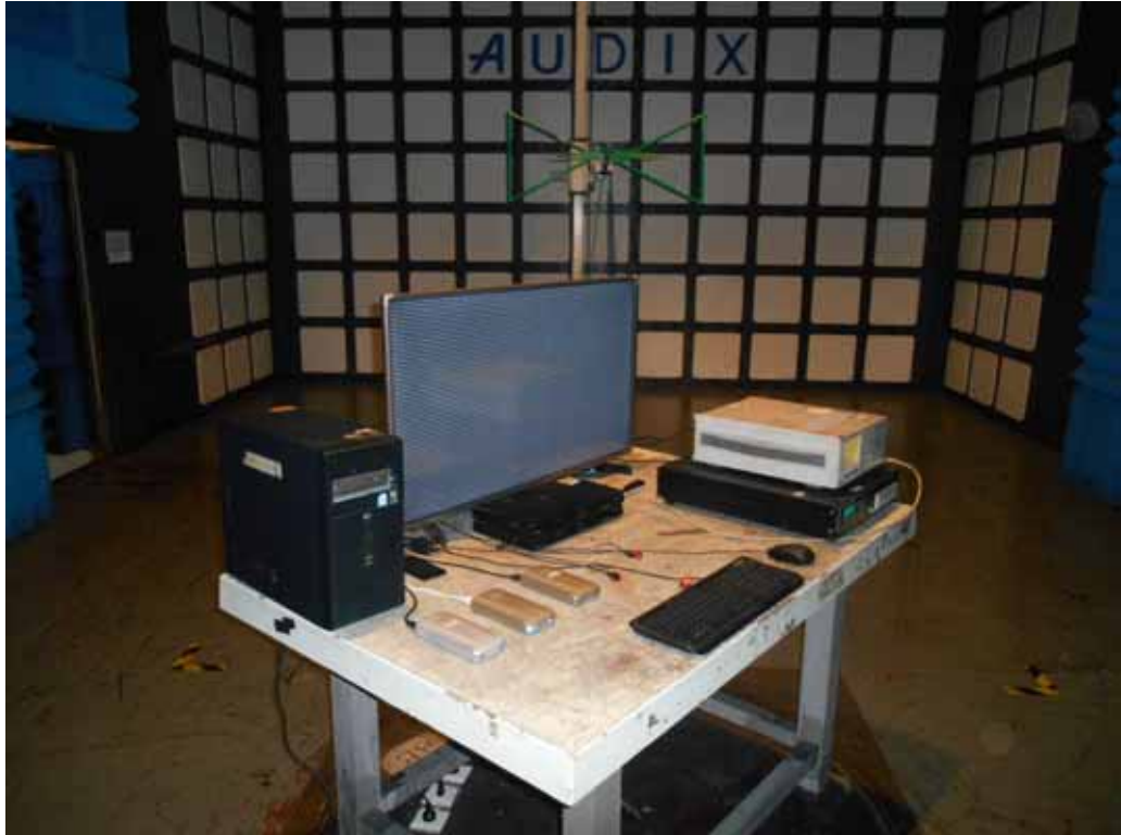
SETUP WITH MAXIMUM DETECTED EMISSION AT HORIZONTAL POLARIZATION (TEST MODE: HDMI 3840*2160@60HZ & 1KHZ PLAYING)