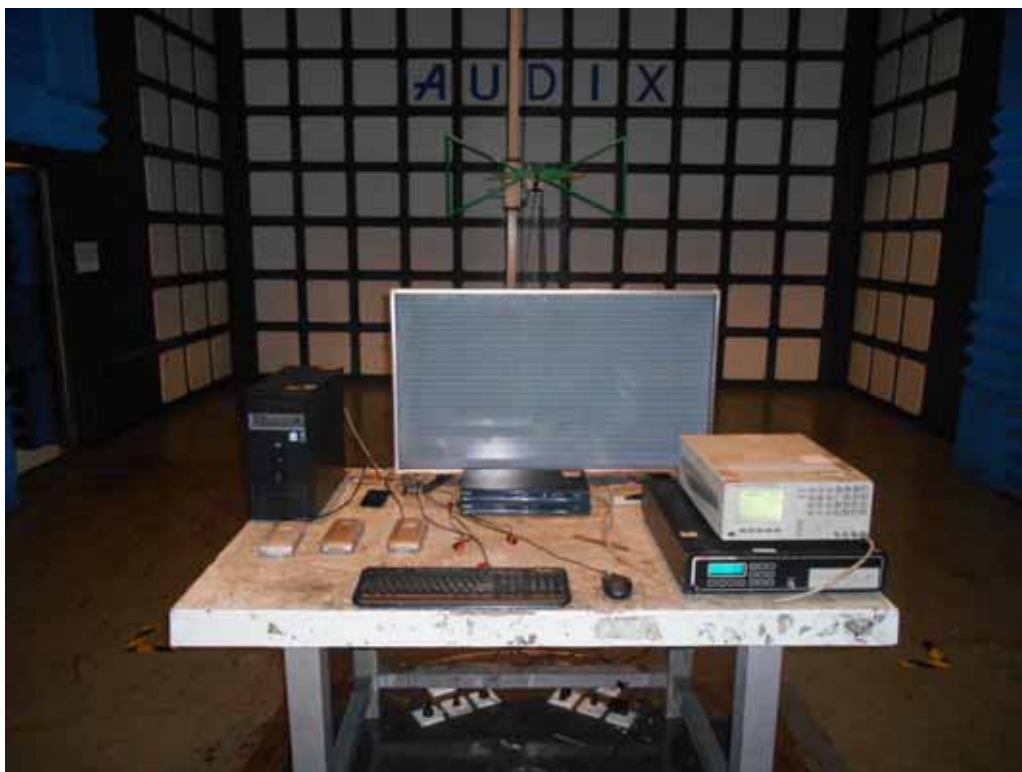
FRONT VIEW OF RADIATED EMISSION TEST (BELOW 1GHZ)