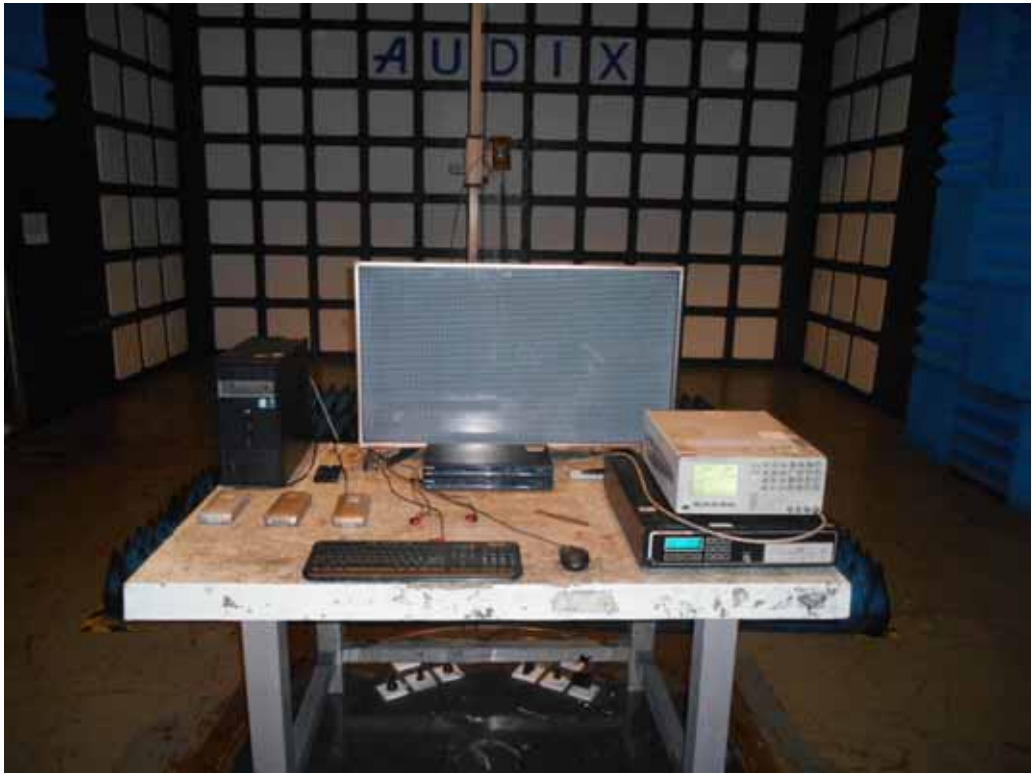
FRONT VIEW OF RADIATED EMISSION TEST (ABOVE 1GHZ)