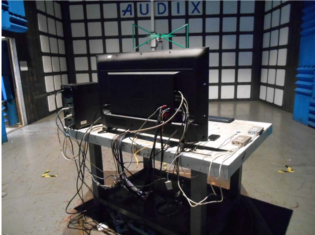
SETUP WITH MAXIMUM DETECTED EMISSION AT HORIZONTAL POLARIZATION (TEST MODE: HDMI 3840*2160@60Hz & 1kHz PLAYING)