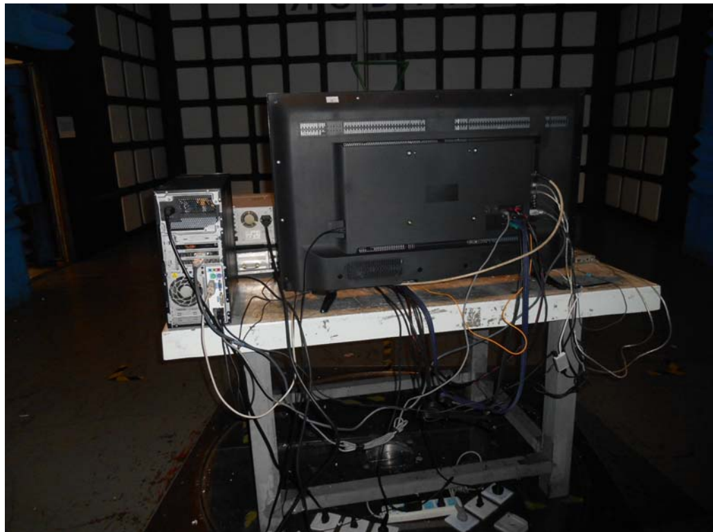
SETUP WITH MAXIMUM DETECTED EMISSION AT VERTICAL POLARIZATION (TEST MODE: HDMI 3840*2160@60Hz & 1kHz PLAYING)