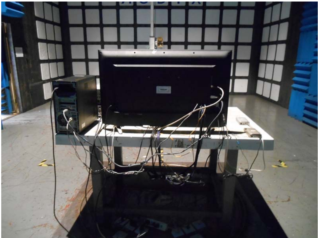
BACK VIEW OF RADIATED EMISSION TEST (ABOVE 1GHZ)