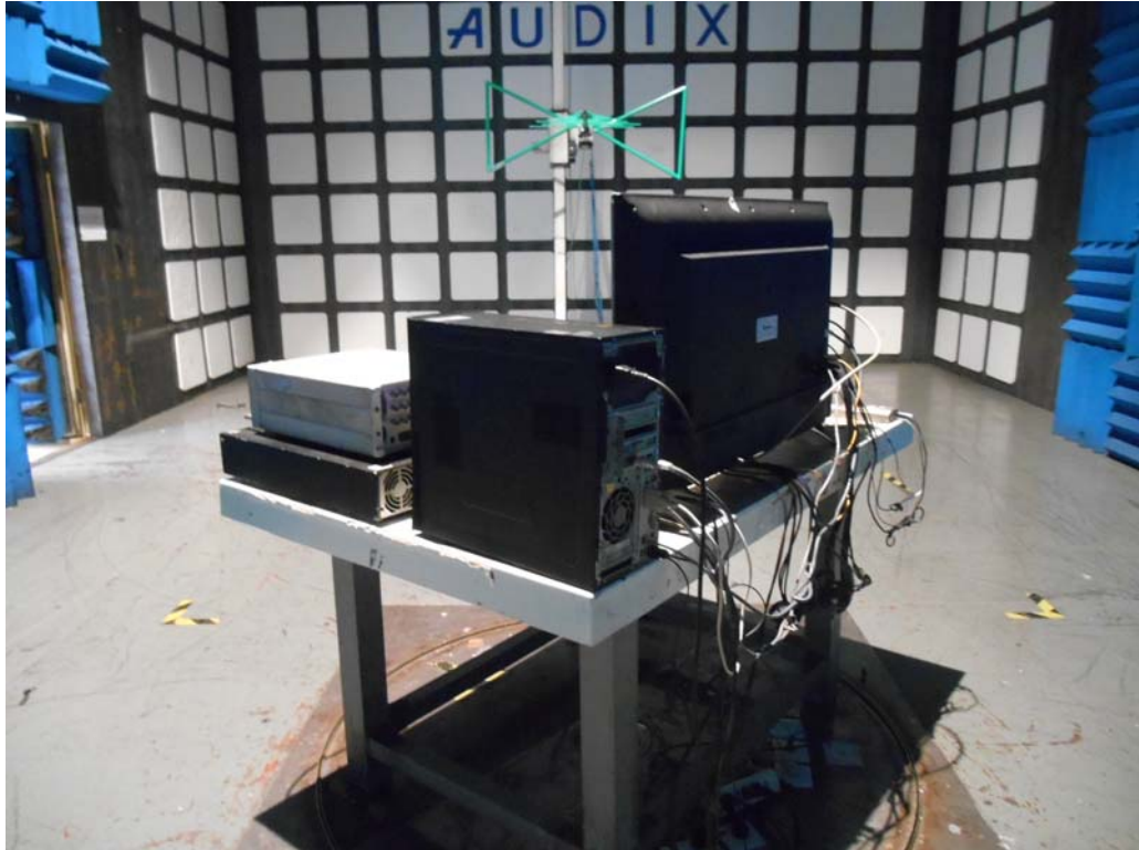
SETUP WITH MAXIMUM DETECTED EMISSION AT HORIZONTAL POLARIZATION (TEST MODE: HDMI 1920*1080@60Hz & 1kHz PLAYING)