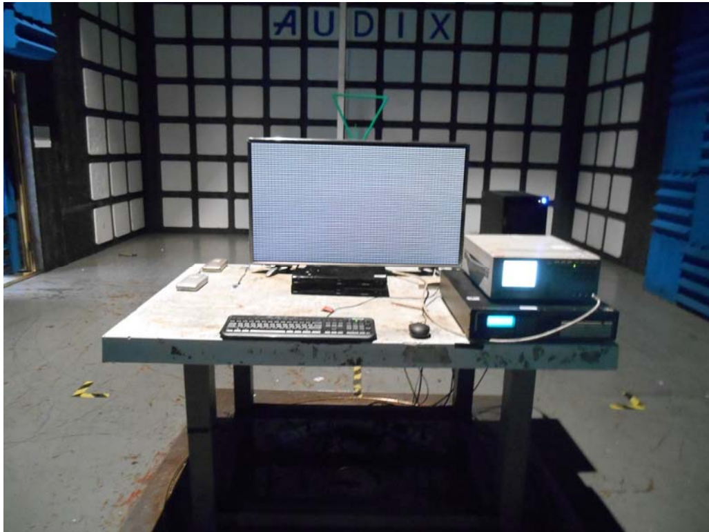
FRONT VIEW OF RADIATED EMISSION TEST (BELOW 1GHZ)