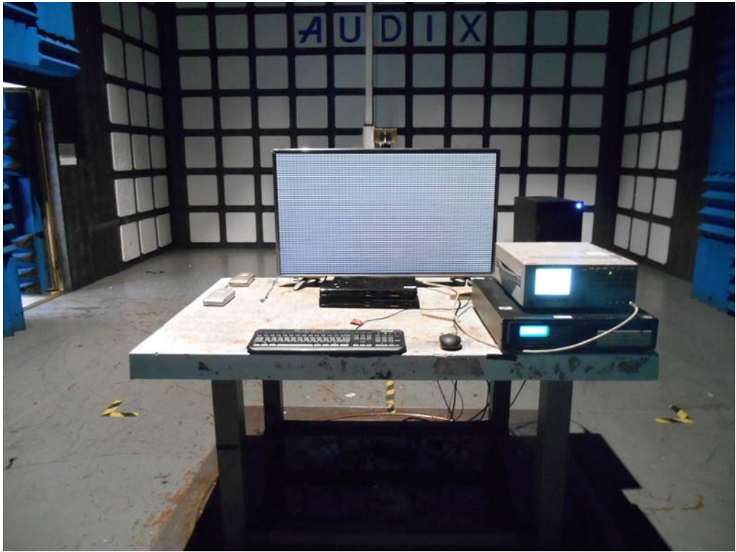
FRONT VIEW OF RADIATED EMISSION TEST (ABOVE 1GHZ)