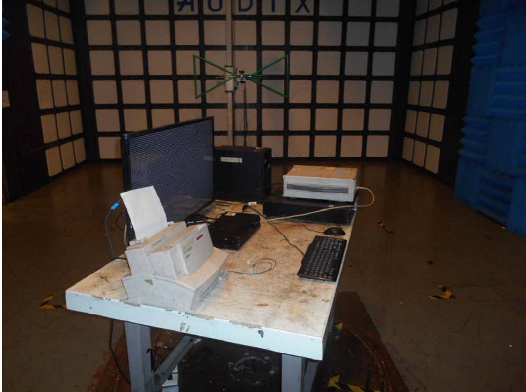
SETUP WITH MAXIMUM DETECTED EMISSION AT HORIZONTAL POLARIZATION (TEST MODE: USB PLAY)