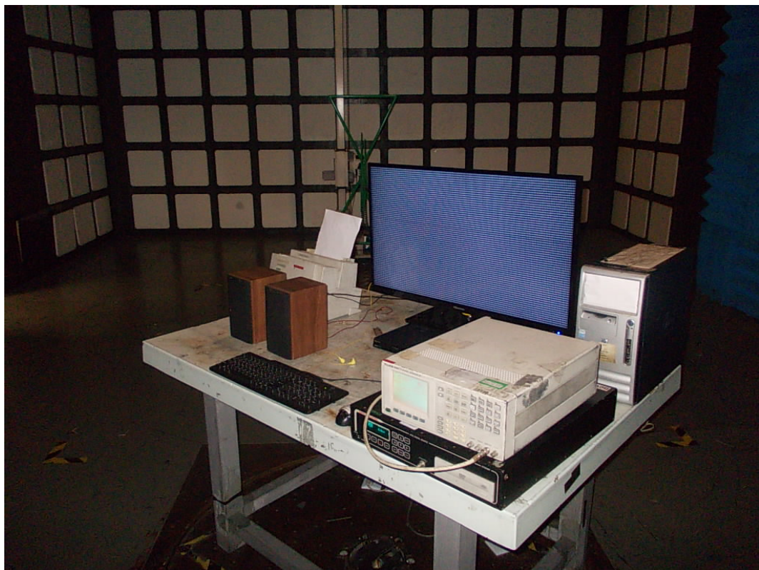
SETUP WITH MAXIMUM DETECTED EMISSION AT VERTICAL POLARIZATION (TEST MODE: HDMI 1920*1080@60Hz)