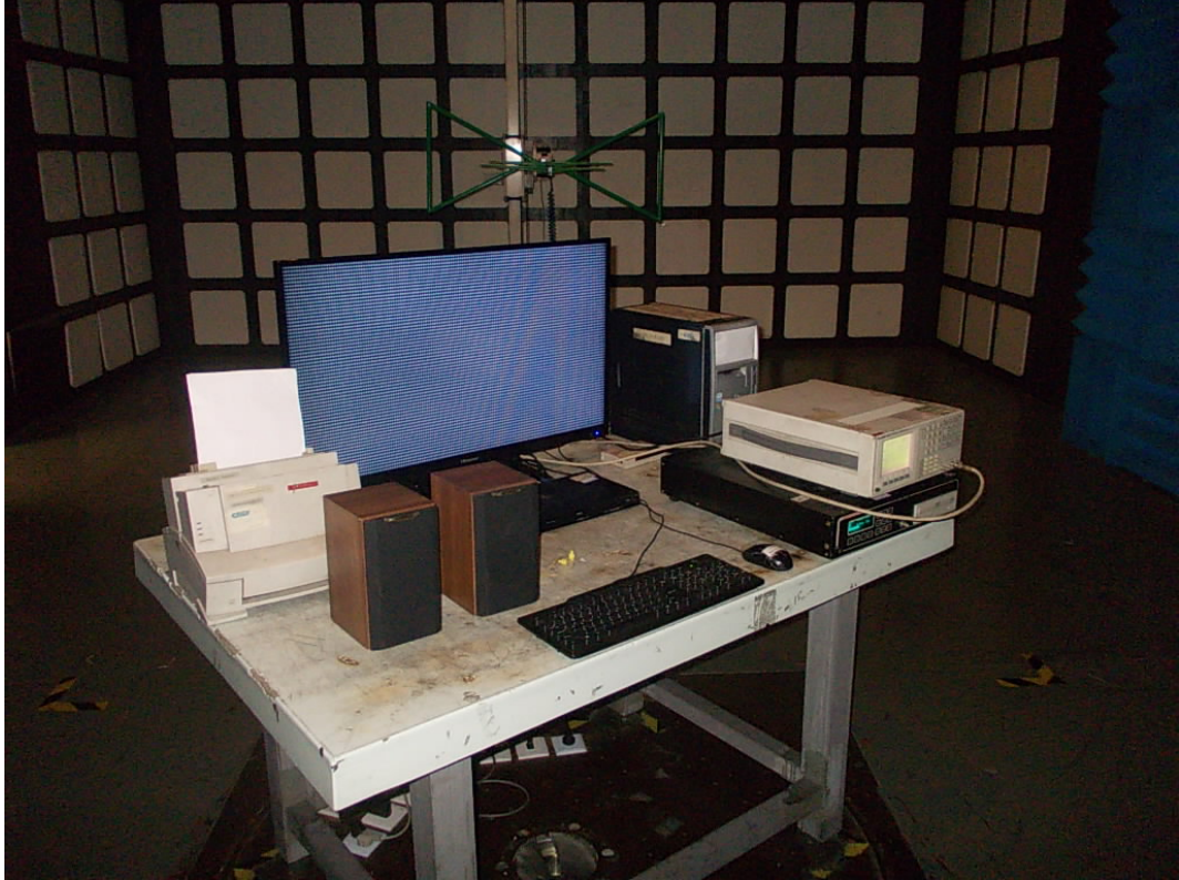
SETUP WITH MAXIMUM DETECTED EMISSION AT HORIZONTAL POLARIZATION (TEST MODE: HDMI 1920*1080@60Hz)