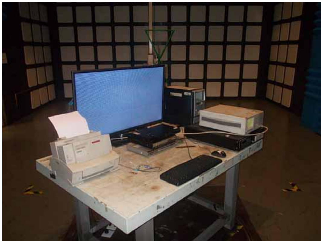
SETUP WITH MAXIMUM DETECTED EMISSION AT VERTICAL POLARIZATION (TEST MODE: HDMI 1920*1080@60Hz)