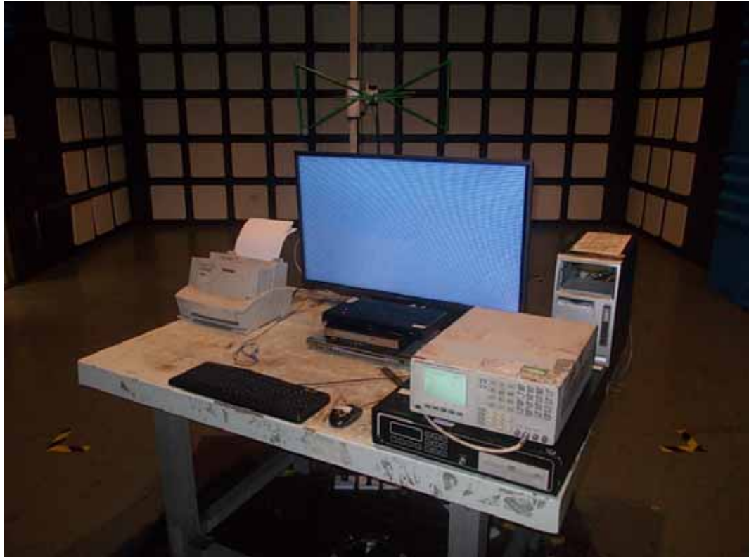
SETUP WITH MAXIMUM DETECTED EMISSION AT HORIZONTAL POLARIZATION (TEST MODE: HDMI 1920*1080@60Hz)