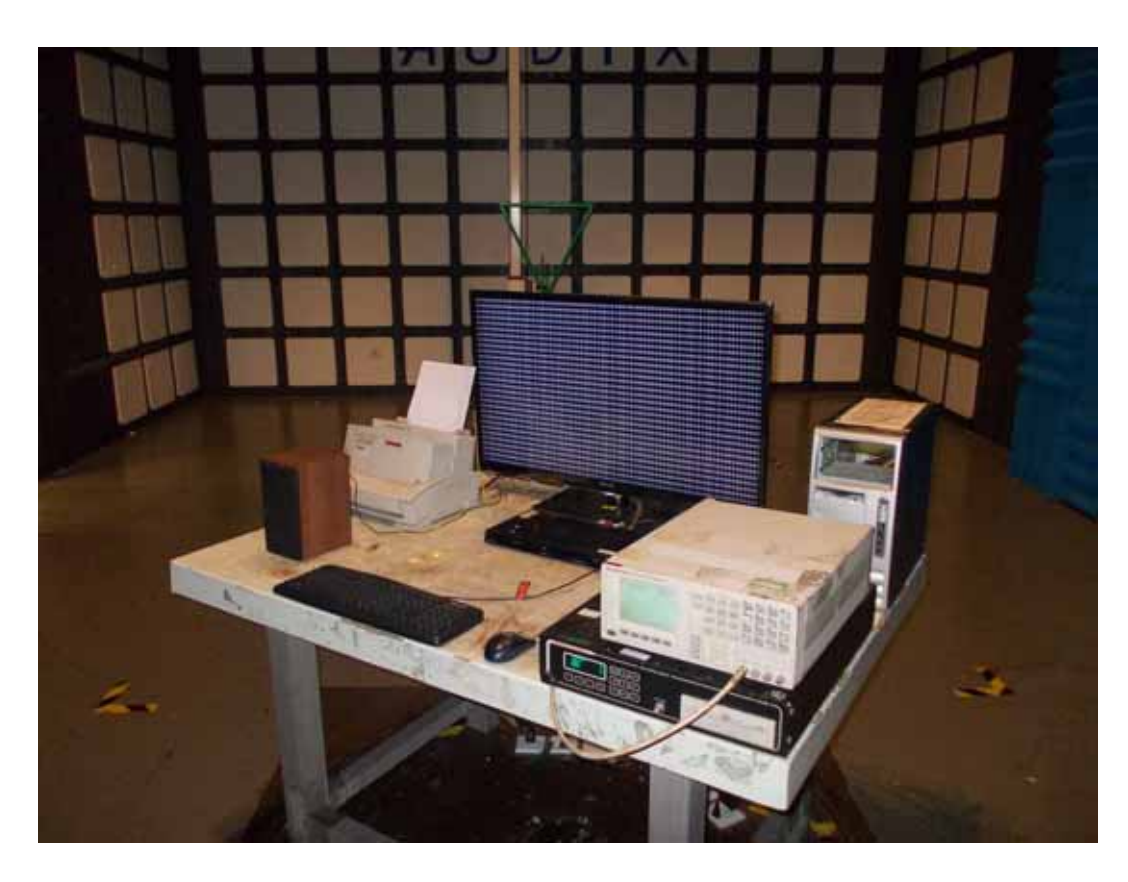
SETUP WITH MAXIMUM DETECTED EMISSION AT VERTICAL POLARIZATION (TEST MODE: D-SUB 640*480@60Hz)