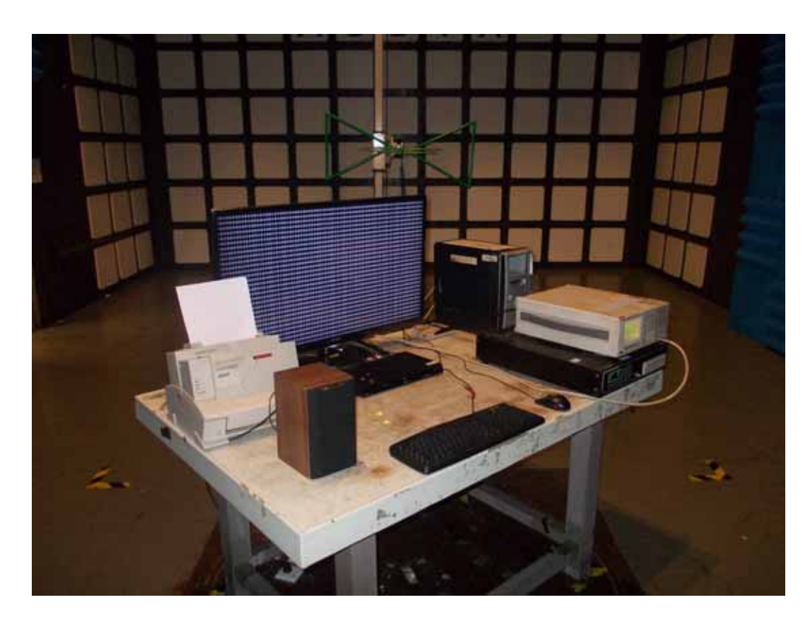
SETUP WITH MAXIMUM DETECTED EMISSION AT HORIZONTAL POLARIZATION (TEST MODE: D-SUB 640*480@60Hz)